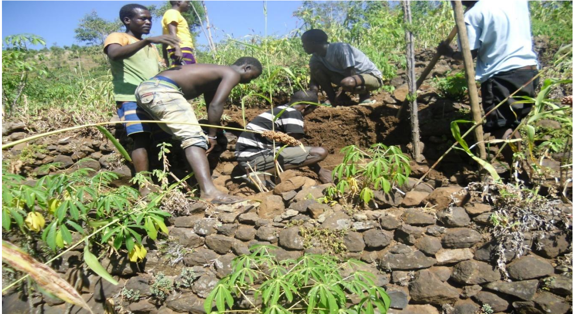
Fig.3 Stone terrace construction in the study area

Terrace construction requires a skill and labor. Skill is needed to have a long lasting terrace and labor is needed to dig the foundation, to carry stones and to construct. Thus during terrace construction in most cases elderly people sit and arrange the stones where adults dig the soil (foundation) and help in carrying stones to be constructed. The following table shows terracing per plot size in the study area