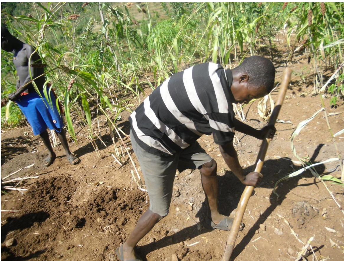
Fig 8 Single edged plough tool (Kuchuma)