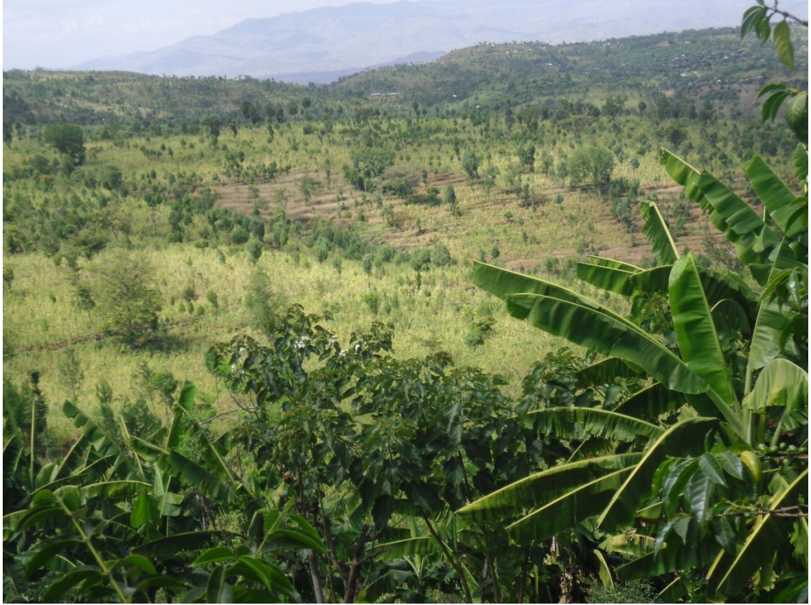
Fig 5 Agro-forestry practice in the study area