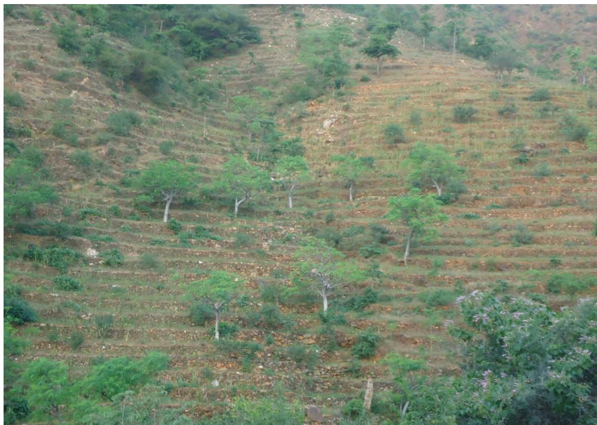
Fig. 4. Stone terraced cultivated land in the study area

bands instead of stone terraces. This is the fact shown in the table above according to the data collected from the study area, the slope of an area results in stone trace building if steep or gentle or soil bund if the slope is flat.