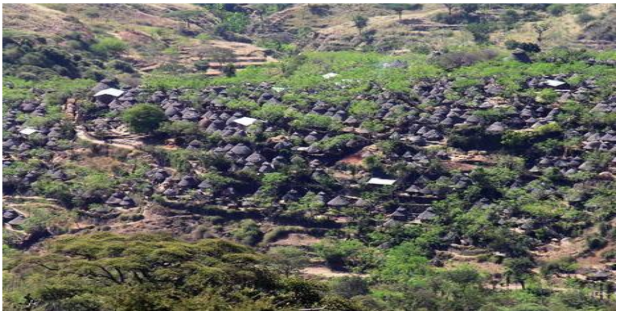
Fig 2 Walled village of Konso

Traditionally the Konso land is divided to four regions namely Karati, Takadi, Turo and Gumaide. Each of these regions constitutes a number of autonomous walled towns. The Konso are distinguished among many other features by their stone walled towns called pallets that are encircled by Kawata (Watson 1998).