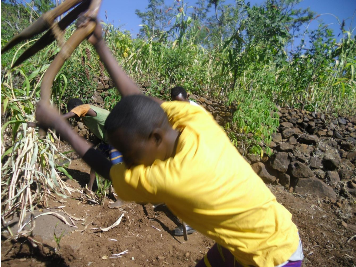
Fig 7. Double edged plough tool (Bayra)

Bayra is prepared in most cases from three different woods where some times can also be constructed from a single wood that has three branches to form a bayra. Among these three, two helps for ploughing which entered in to a sharp metal edge and the separate branch helps for holding and has a shape of number 5. Bayra is used mainly during seed time and when extensive ploughing is needed. But kuchuma is a single stick of wood with a metal ploughing edge.