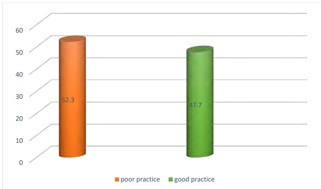
Figure 2. Showing level of nurses’ practice regarding pressure ulcer prevention and management

Practice test questions distribution regarding pressure ulcer prevention and management based on 20 questions. Each answer was given code “1” for yes and “2” for no. The overall nurses’ practice score regarding pressure ulcer prevention and management was obtained from the table below by calculating all the yes responses percentage (total percentage sum= 1239.3) and dividing it by total number of practice test questions maximum score 20(100%). The overall practice percentage of nurse’s perform always pressure ulcer prevention and management (P=61.96%, Mean=12.39, SD±4.70924) with minimum3and maximum20scores. From 128 Adult Intensive Care nurses, more than half 52.3% of nurses had poor practice, while the rest 47.7 % respondents have good practice. Mean value was used to classify AICU practice about pressure ulcer prevention and management. Nurses practice score above the mean value were taken as having good practice and those who score below and equal to the mean are considered as having poor practice. According to this study that the overall nurses’ practice was poor regarding pressure ulcer prevention and management. The highest practice response indicated that 84.4% they perform skin care as a routine work of their Unit these all presented below in Table 3and figure 2