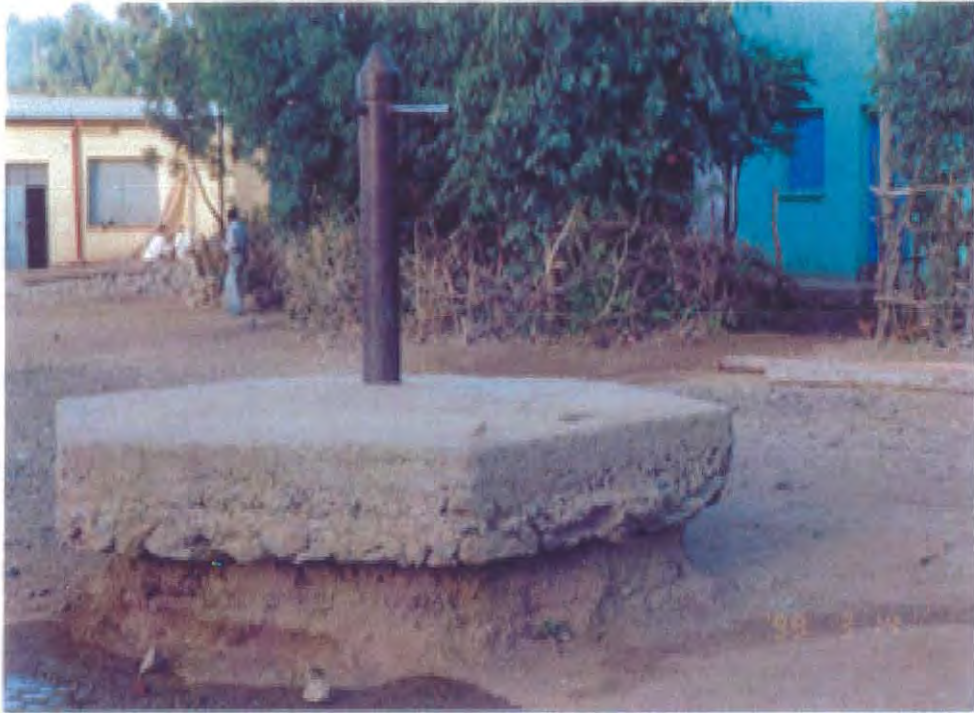
My Edaga water well in center of Axum town

The per capita consumption of 2005 was 24.58 liters considering the then population of 45,000 (this is calculated for domestic use only). When we consider public and industrial consumption, the per capita consumption would have been much lower. Because of the increasing demand of water, various pressures been created in the town. Additionally institutions were constructed like Axum University and seriously exacerbating the problem. In response additional wells were drilled and the capacity of production has increased. At present, 12 boreholes under the control of the water agency and one well belonging to the Axum hospital are functioning. The actual yield of the wells at present is as follows.