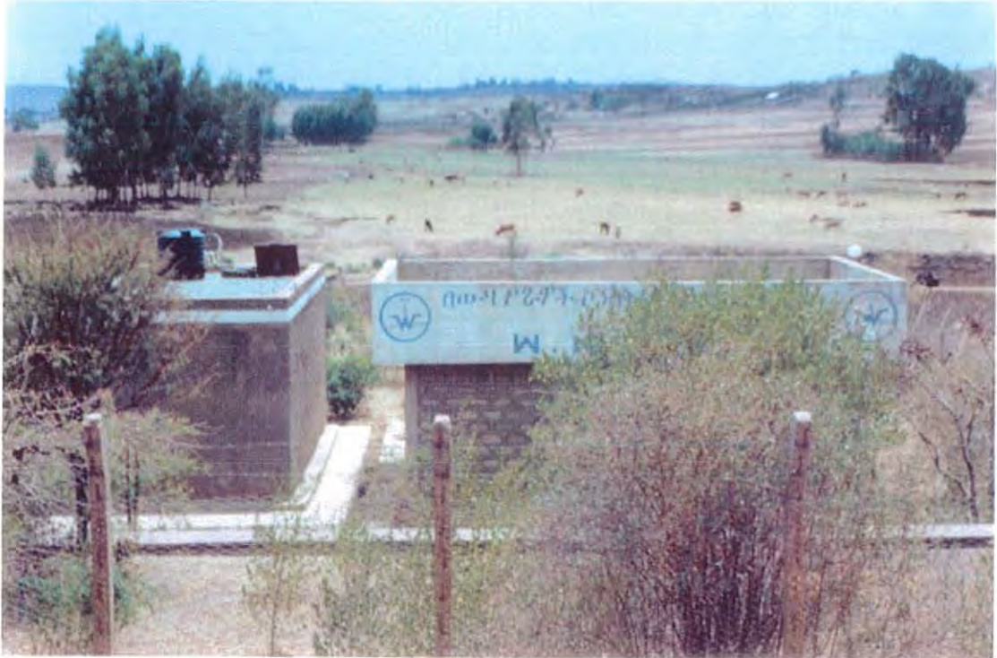
MaiAbekat water reservoir and main station of Axum water supply

Most of the consumers that do not have their own yard taps prefer public standpipes, as the price is relatively cheaper compared to other distribution mechanisms.