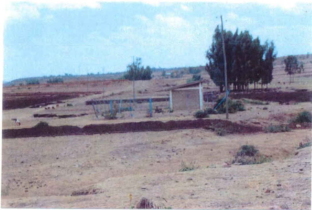
Water well in field No.1 near MaiAbekat (5 km south west of Axum town)

Functional boreholes, including the recently drilled boreholes of Areikto are well 1, well 2, well 4, well 5, and well 7 found at Gebru Greek; Apw2 and Apw5 found at field No 1 and My Edaga in the center of the town; Areikto 1 and Areikto 2 in Areikto near Axum University; and Debrebrhan well at Debrebrhan church locality. The researcher had also observed that a significant portion of the population use Maishum pond which is unprotected and unpurified water as their water source. Members of the focus group discussion elders' prominent and ordinary citizens of the town had all witnessed that, there are many people who entirely depend on those sources.