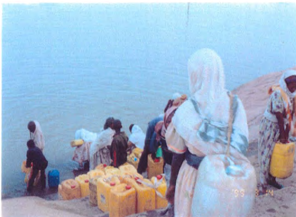
Households fetching water from Maishum water pond (unprotected source)