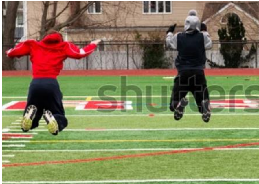
Figure3.3. Broad jump field

Equipment required: A soft landing surface is preferable, a non-slip floor for takeoff, and a tape measure to measure the distance jumped. There is also commercial long jump landing mats available.