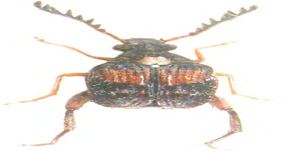
Figure 2. Adult Callosobruchus chinensis