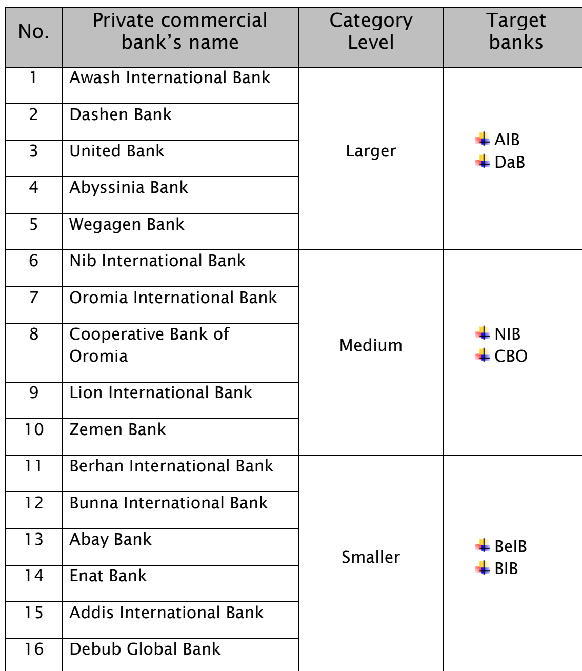
Table 4.10. Categories of private banks based on their total assets by 2016