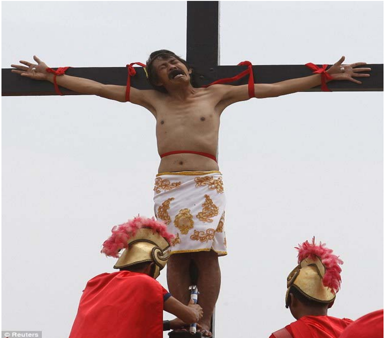
Figure 2: Philippines Christians nailed to the cross