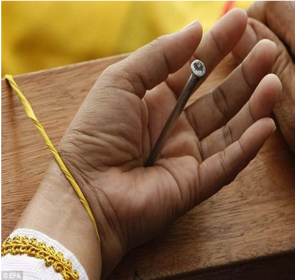
Figure 1: the practice of ascetic life in the Philippines