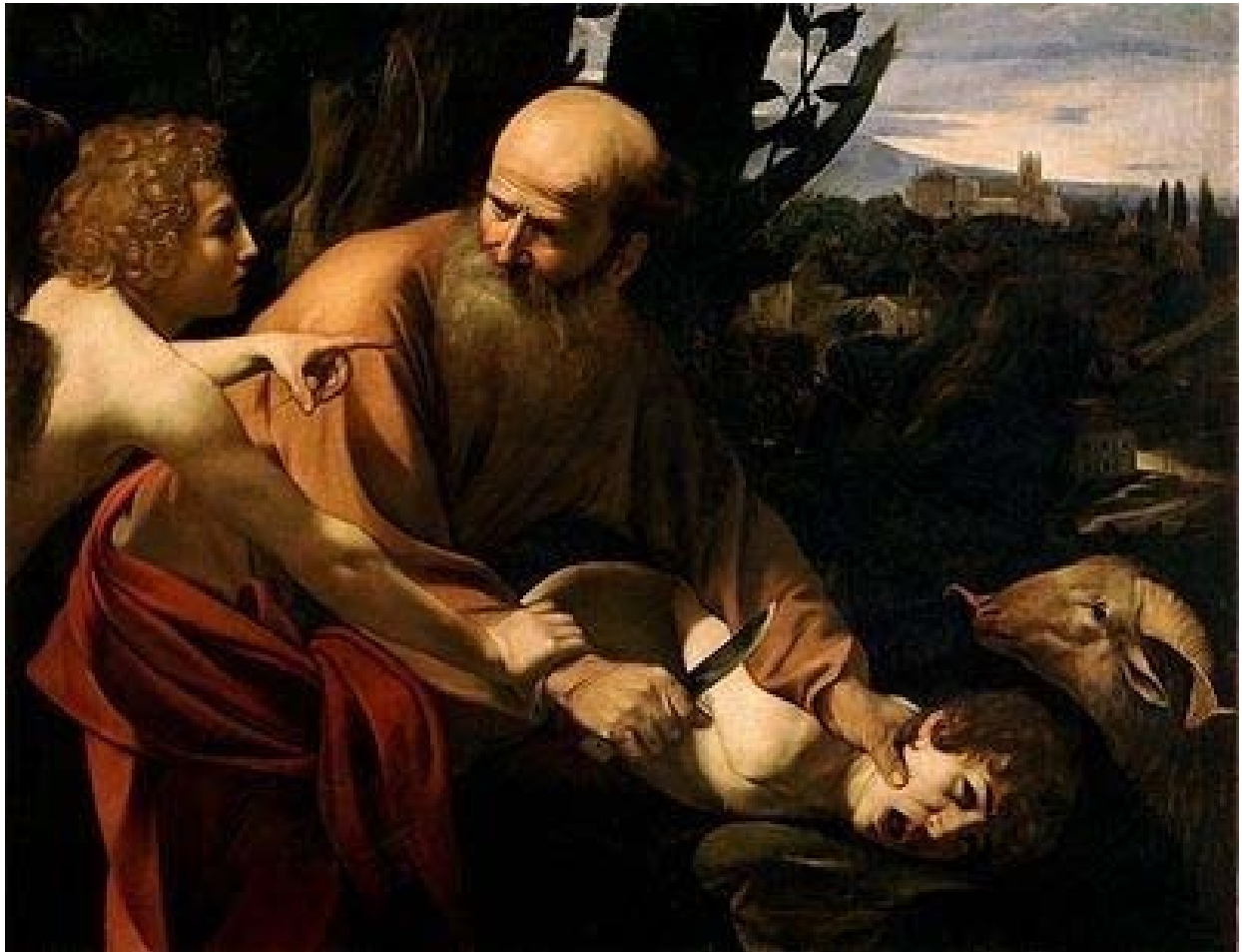
Figure 3: human sacrifice

Source: Genesis 22:1-18 [ http://www.sunypress.edu/pdf/61866.pdf ]