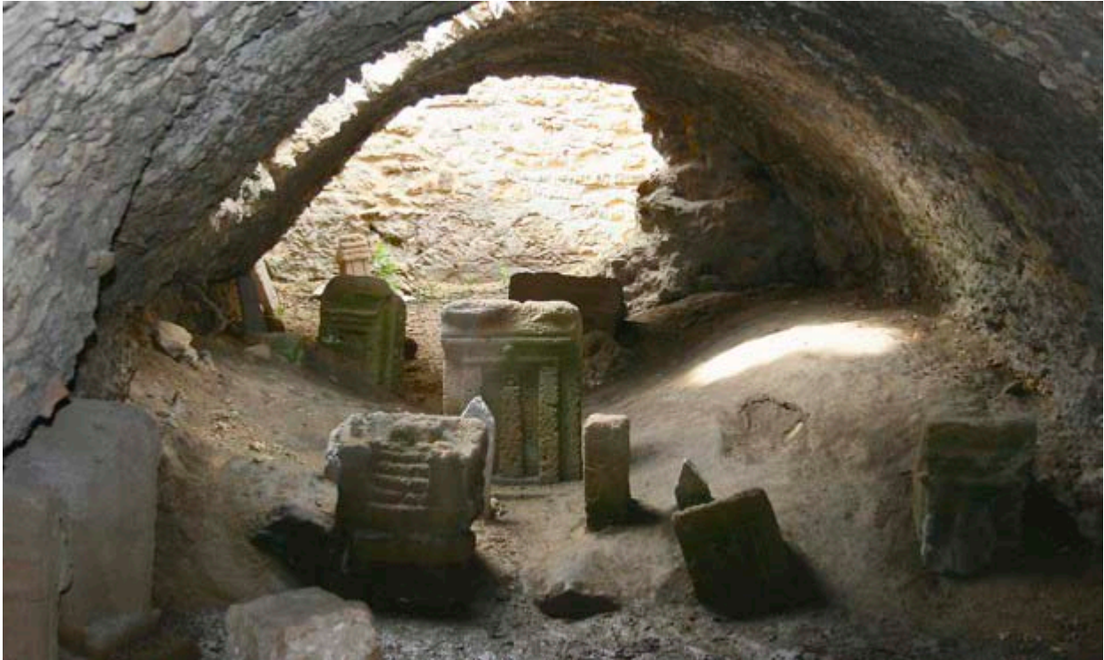
Figure 4: child roasting place

A tophet outside Carthage, a special part of a cemetery dedicated to the burial of infants, according to Josephine Quinn.