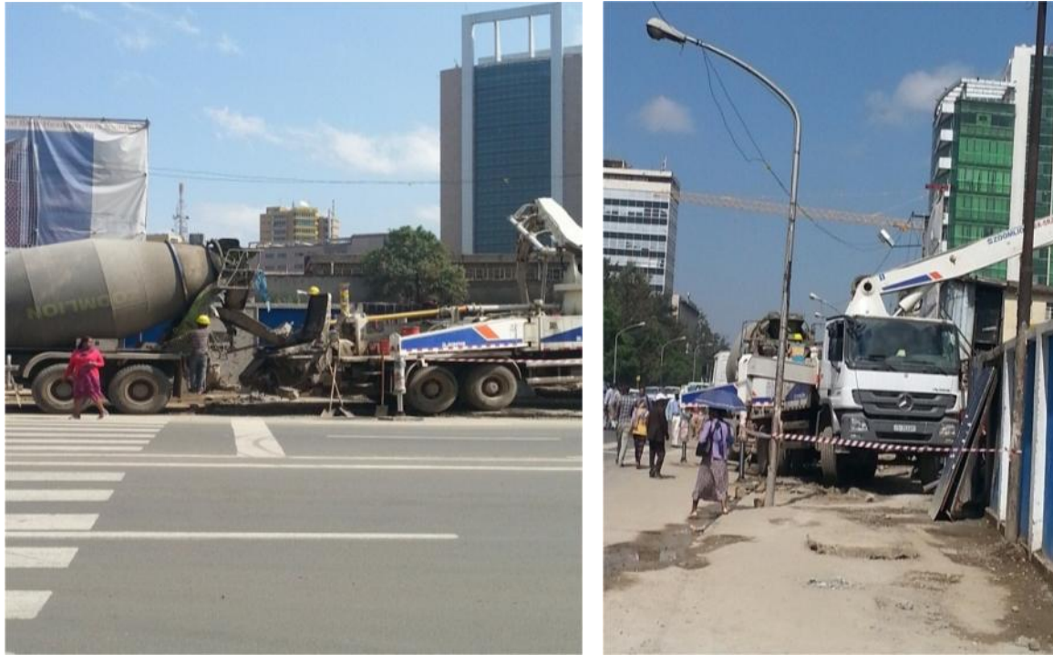
Figure 4.6 Ready-mixed concrete practices in Addis Ababa

Table 4.15 depicts market cost of ready-mixed concrete practices in Addis Ababa. These costs of ready-mixed have taken from five ready-mix concrete manufacturer companies. The ranges of this cost are between (2400-2450 Birr) and cost break down is done based on highest cost.