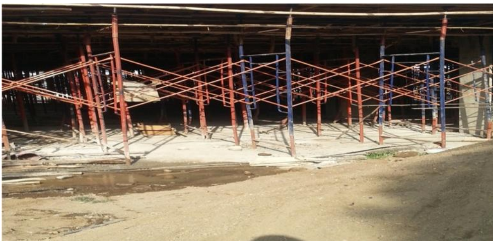
Figure 4.5 Metal shoring material practices in Addis Ababa privet building project

From observation of the case studies on construction projects sites, eucalyptus woods were being reused from 4 to 8 times for shoring and scaffolding construction. On the other hand, it was difficult to identify how many times metal shoring and scaffoldings can be reused and there were not previous data available. In fact, initial cost of metal scaffolding is expensive but according to gathered data on other Addis Ababa building projects site, metal shoring and scaffoldings can give service for longer period of time than eucalyptus scaffolding. A study conducted by Eyerusalem Kelemewerk (2017), indicated that, using H-frames metal scaffolding instead of using eucalyptus wood have comparative advantage in cost and speed. This result is similar with the respondent's opinion and observation of actual sites. Figure 4.5 shows metal shoring material practices in Addis Ababa privet building projects.