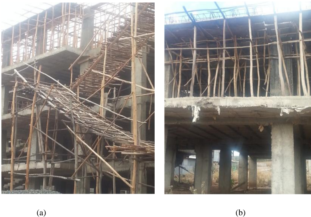
Figure 4.4 Practice (a) scaffolding and (b) shoring systems on the case study condominium building projects.

Interviews were conducted on the selected projects to asses weather the respondents were aware of the advantages of metal shoring material over eucalyptus wood in terms of speed of construction and their costs. 100% of respondents stated that metal shoring and scaffolding speed up construction time. Figure 4.4 illustrates Practice of shoring and scaffolding systems on the case study condominium building projects