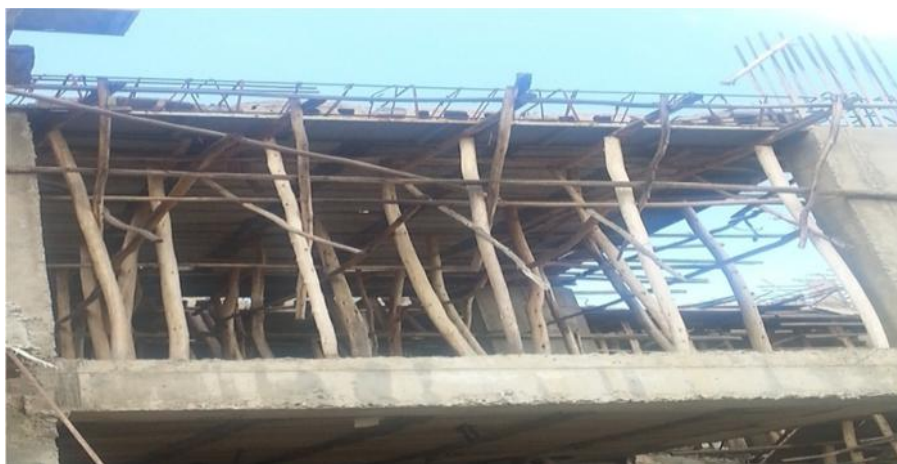
Figure 4.3 Support posts for precast beams and ribbed slab

Prefabrication being practiced in condominium building projects is partially prefabrication system. Precast beams and ribbed slabs manufactured off site then constructing with cast in place construction. As observed in the case study projects, no formwork is required to support the ribbed slab, when compared to solid slab, this method saved cost of formwork as result of this, it reduce significant amount of the project cost. In addition to this, electrical cables and sanitary units can be executed in parallel, and the slab re-bars can be laid on both directions. Then after, the 6cm concrete floor slab is casted monolithically with the cast in place beams and pre-cast beam. In addition, constructing it by using ribbed slab significantly reduced cost of support scaffolding and speed up construction time. Figure 4.3 shows support posts for precast beams and ribbed slab.