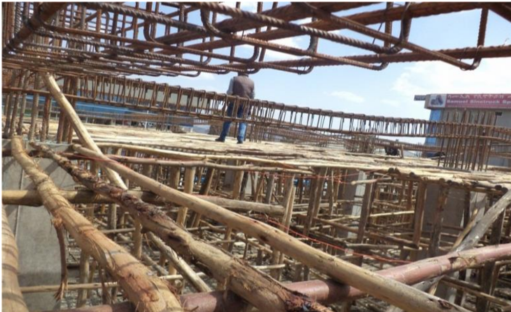
Figure 2.2 eucalyptus wood shoring and scaffolding practice in Addis Ababa.

Keith Pott (2008) stated that eucalyptus wood shoring and scaffolding can be constructed in different shapes and sizes, to support formwork for in-situ concrete construction and they should be designed to withstand the self-weight of the whole shoring and scaffold system, construction and working loads.