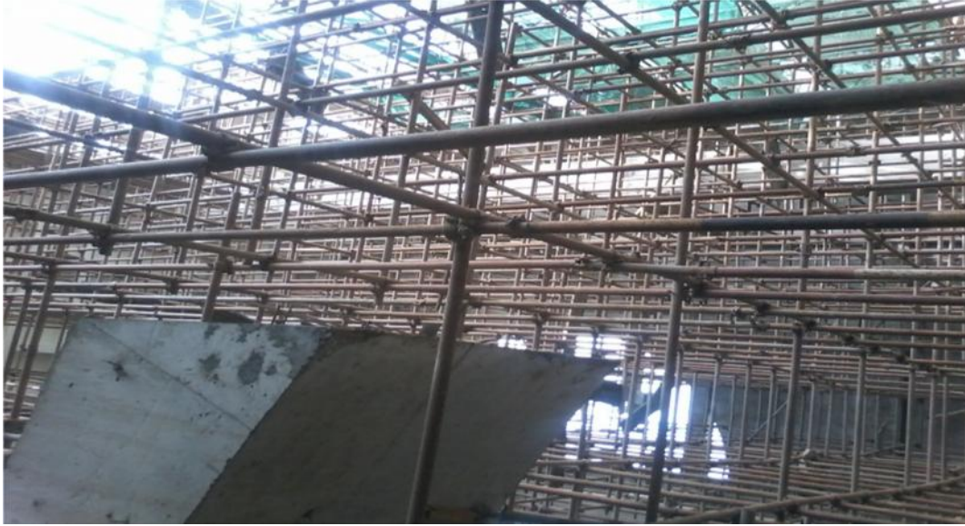
Figure 2.1 Metal shoring and scaffolding practices in Addis Ababa