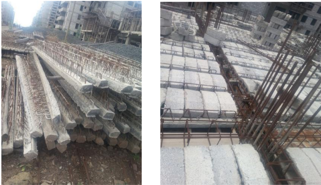
(a) (b) Fig 4.2 a, b, Laid Precast Beams and ribbed slab

Prefabrication being practiced in condominium building projects is partially prefabrication system. Precast beams and ribbed slabs manufactured off site then constructing with cast in place construction. As observed in the case study projects, no formwork is required to support the ribbed slab, when compared to solid slab, this method saved cost of formwork as result of this, it reduce significant amount of the project cost. In addition to this, electrical cables and sanitary units can be executed in parallel, and the slab re-bars can be laid on both directions. Then after, the 6cm concrete floor slab is casted monolithically with the cast in place beams and pre-cast beam. In addition, constructing it by using ribbed slab significantly reduced cost of support scaffolding and speed up construction time. Figure 4.3 shows support posts for precast beams and ribbed slab.