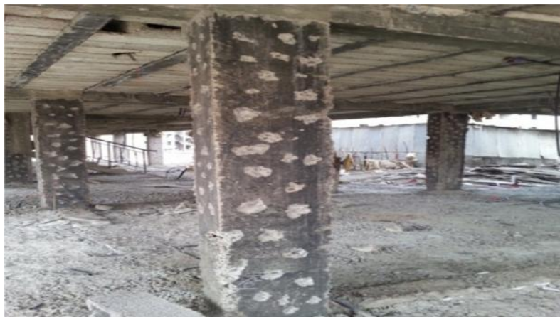
Figure 4.9 Chiseling surface of concrete structure on selected condominium building project.

The above picture was taken to show the possibility of constructing good surface finish concrete by using good quality of formwork, in addition if the surface of concrete has good surface finish, it can be used without cement plastering and chiseling by applying only gypsum plastering and painting, as a result the cost of cement plastering and chiseling can be decreased, consequently the cost of building can significantly be reduced. When chiseling the building, beams, slabs columns stair cases landings and shear wall, contractors spend significant amount of cost. Furthermore, chiseling work promotes cracks on structures of the building and it has an effect on the durability of concrete. Figure 4.9 shows chiseling work on selected condominium building project.