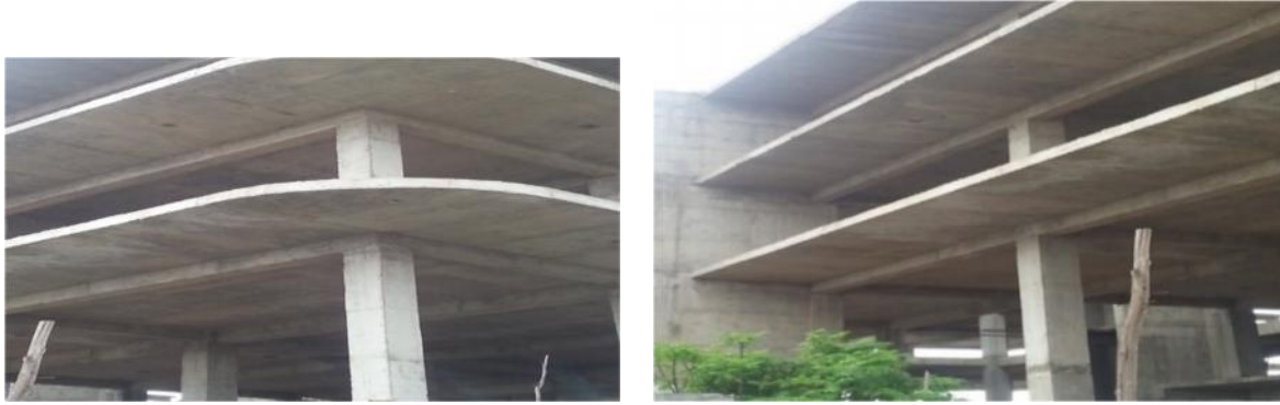
Figure 4.8 Good quality of concrete suffice finished and located around Hayat

The above picture was taken to show the possibility of constructing good surface finish concrete by using good quality of formwork, in addition if the surface of concrete has good surface finish, it can be used without cement plastering and chiseling by applying only gypsum plastering and painting, as a result the cost of cement plastering and chiseling can be decreased, consequently the cost of building can significantly be reduced. When chiseling the building, beams, slabs columns stair cases landings and shear wall, contractors spend significant amount of cost. Furthermore, chiseling work promotes cracks on structures of the building and it has an effect on the durability of concrete. Figure 4.9 shows chiseling work on selected condominium building project.