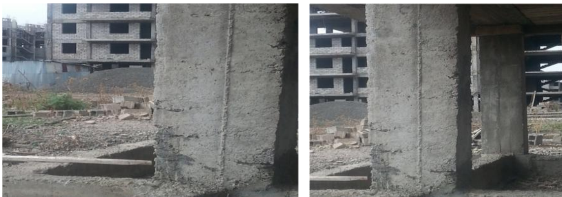
Figure 4.7 Poor quality of concrete surface on selected condominium buildings because of poor quality of formwork.

In this study respondents were asked whether using good quality formworks could have an effect on the quality of concrete surface finish or not. 82.85% of respondents strongly agreed that if formwork surface have good quality cement plastering and chiseling works are unnecessary and 10% respondents slightly agreed on the other hand 7.15% respondents didn't agree totally. Majority of the respondents stated that using good quality of formworks, minimizes the material required for the correcting defective works and reduce labor cost as result, the cost of project will be decreased.