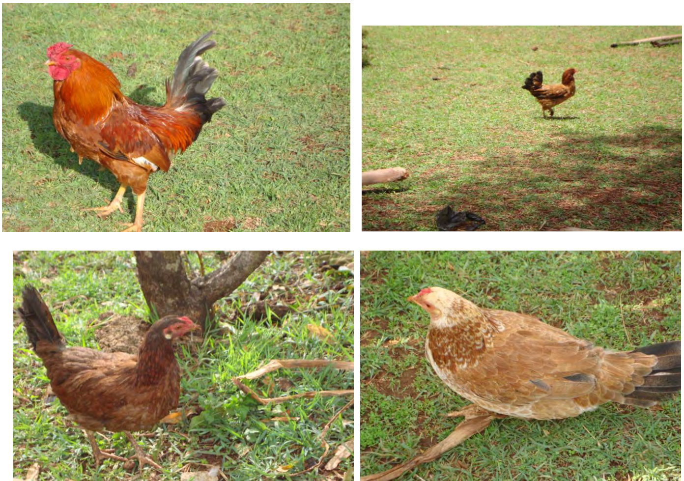
Fig.1. Dawo Male (Left top) and females (Top right and bottom right and left) indigenous chicken

Study of Figure 1 revealed that predominant plumage colour in Dawo male indigenous chicken is light red with rich brown on the back and brown on the breast and thighs with black tinted tail. While females have brown colour with black tail and in some case light brown with white tinted on the breast, thighs and head part with black tail.