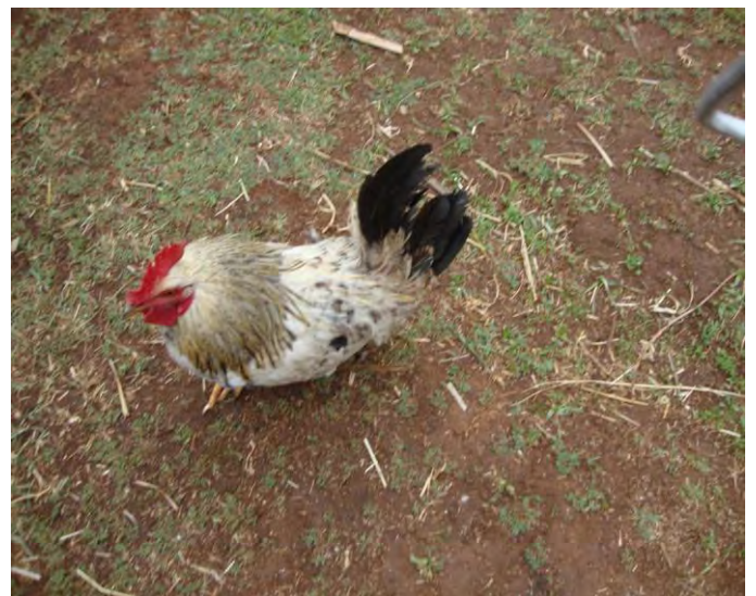
Fig.4. Mehurena Aklile male (Left top and right bottom) and female(Right top and left bottom) indigenous chicken