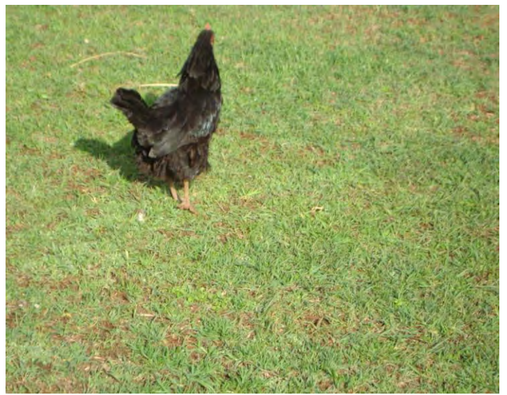
Fig. 3. Mehale Amba males (Left top and bottom) and females (Right top and bottom) indigenous chicken