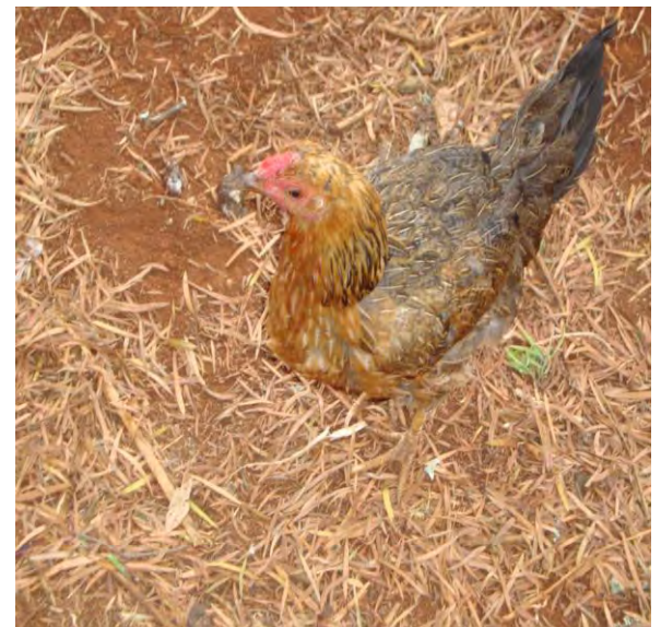
Fig. 2. Seden Sodo males (Left) and females (Right) indigenous chicken