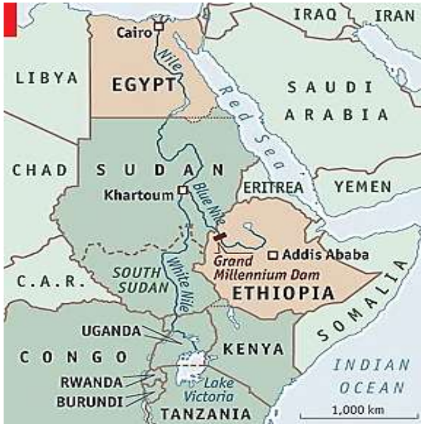
Figure.1. The Nile River Basin