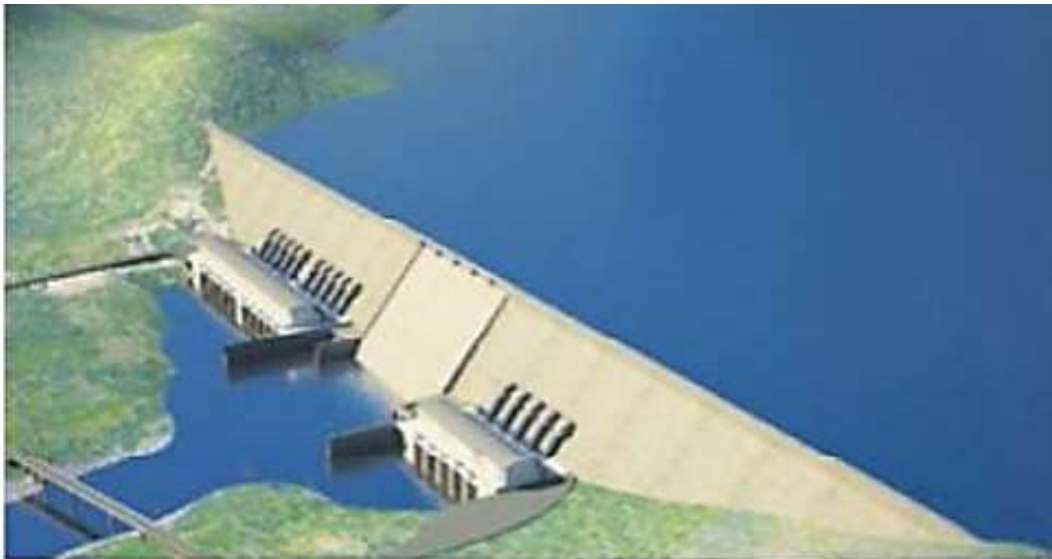
Figure.3. An overview of the GERD

The GERD project is located near the border between Ethiopia and Sudan. Standing tall at 151 meters, the dam on its completion is expected to be the largest hydroelectric power plant in the African continent, producing an estimate 6000MW and sought to create a reservoir with storage capacity of 74 billion MC (Tadesse, 2013).