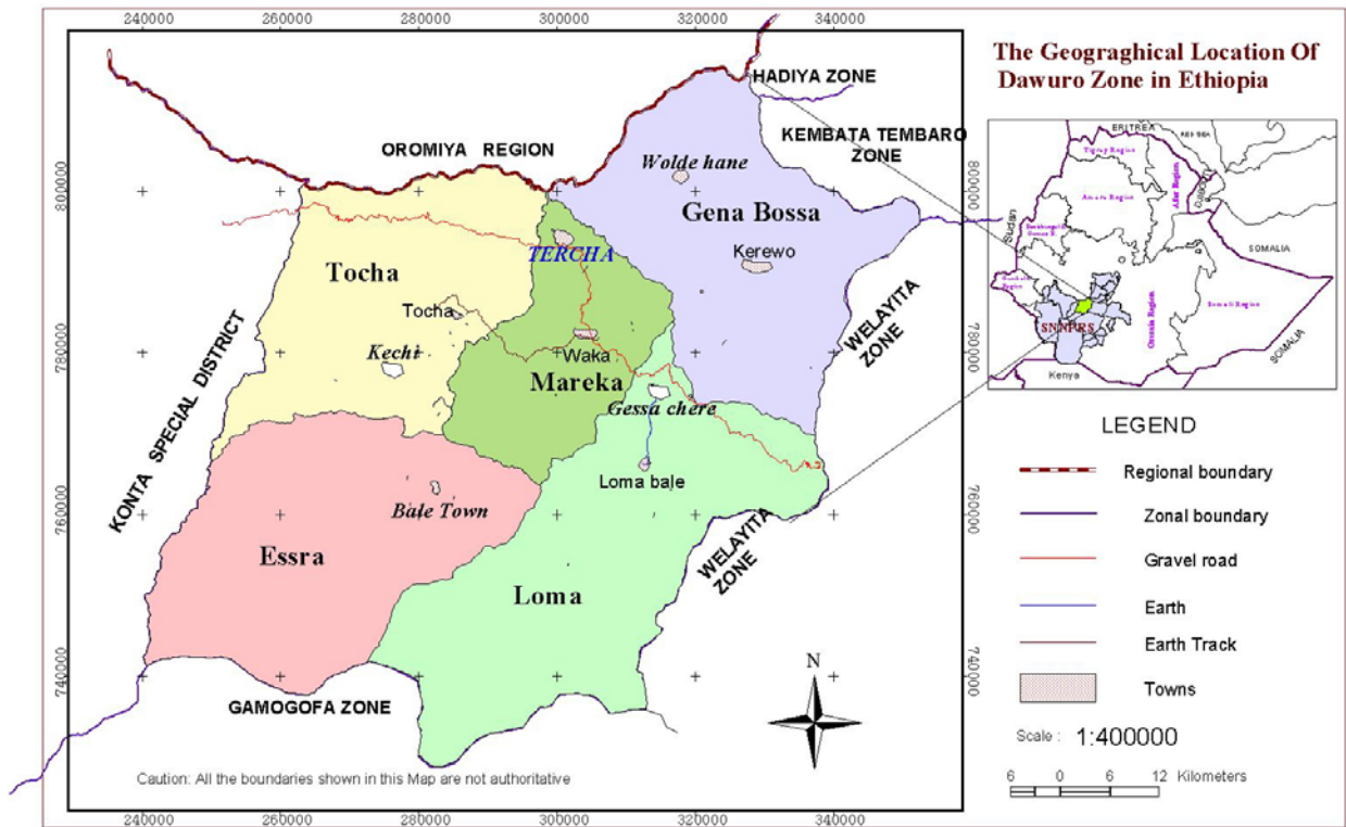
Figure 2.2: Administrative map of Dawuro Zone