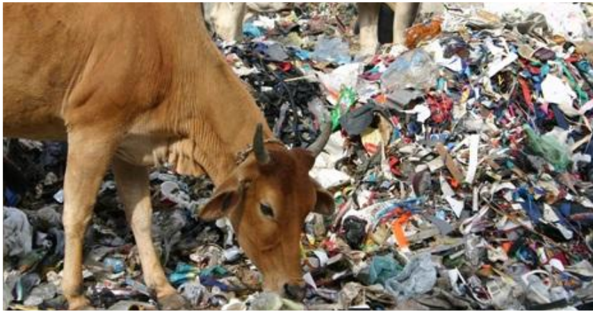
Figure 6 Photo taken from the open dumping sites around market, Durame town