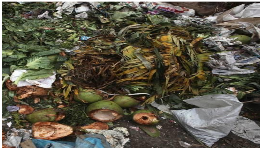
Figure 4: Open dumping site found in the market center Durmae town)

In general, based on the information obtained from various sources magnified, lack of environmentally effective and efficient solid waste disposal methods, the dominance of environmentally hazardous solid waste disposal methods and the need for rapid solution measures to change those environmentally hazardous solid waste disposal methods in to safe and scientifically advisable ways of disposal methods before causing unmitigated damage to the surrounding environment of the study area and health condition of the residents. Unscientific and ordinary Land filling is the common practice for solid waste disposal in many developing countries (Sha' Atoet al , 2009). However, it were not only the information obtained from different sampled households, but also, the field survey made revealed lack of Sanitary Landfill Sites in the study area. The underlying photo depicts the dominance of open dumping and the contributions of Institutional sources have for solid wastes of the town.