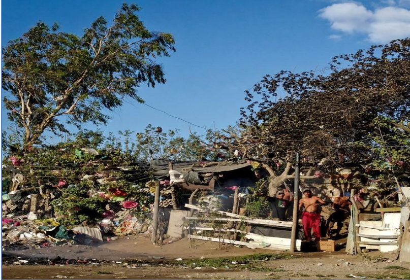
Figure 3: Open dumping site found behind Teklehaimanot Church, Durame

Open burning is the most unacceptable method of disposal of solid waste. The low temperature burning of plastics and PVC emit highly toxic gases such as dioxins and nitrous oxides to the atmosphere. Open dumping is uncontrolled and scattered deposit of wastes at a site. It leads to acute pollution problems, fires, high risk of disease transmission and open access to scavengers animals. It is not a scientific way of waste disposal because open dumping is an uncovered site used for disposal without environmental controls (Mohammed et al , 2012). Although both open dumping and open burning are environmentally able to cause a serious pollution in the air we breathe and water we drink and soil and land degradation, regarding the communal disposal system of the study area the information obtained from sampled households and key informants makes open dumping and open burning the two dominantly practiced disposal methods Durame town.