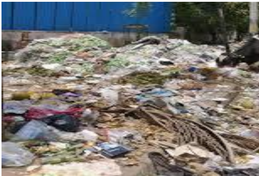
Figure 2 common practiced solid waste disposal system Druame town