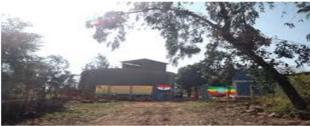
Figure 5: Open dumping site Durame Highschool

The information obtained from the municipality of the town using interview regarding the availability of communal solid waste disposal sites signifies as there are four sites (near Tekelehamont in east the in the south and Durame high school in west poly technique college, in the north Durame hospital are available for the disposal of solid wastes in different parts of the town. The information gained from the municipality also indicates that, it is only one of these sites are being used properly by the local people. The underlying problem for this are the absence of the provision of waste disposal equipments by the municipality and improper use of holes allocated for disposal purpose by the people.