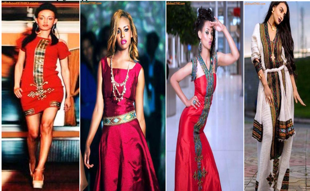
Picture 5. AA city girls typical modern fashion dress with traditional cultural fabrics.