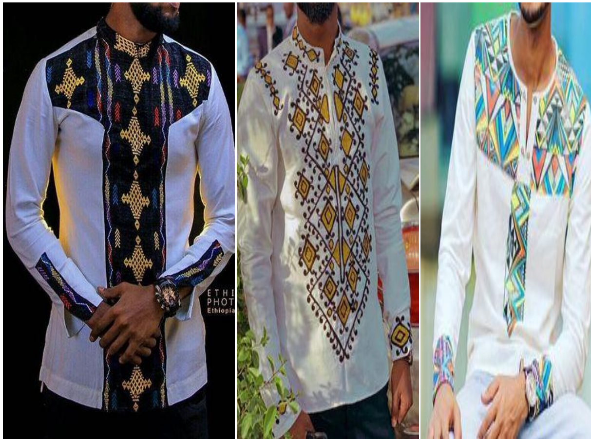
Picture 2. AA city Men's traditional cultural clothe with modern fashion design showing