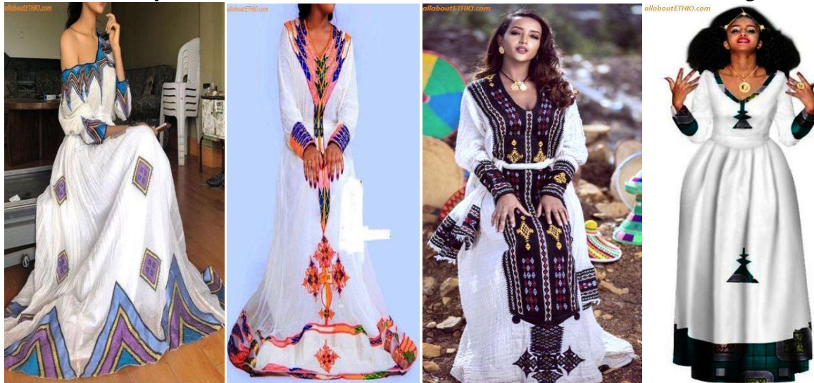
Picture 9. AA city women different LC traditional clothes trends with modern design