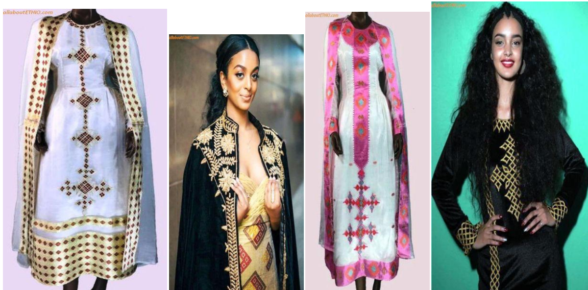
Picture 10. AA city traditional clothes old to modern fashion evolution patterns