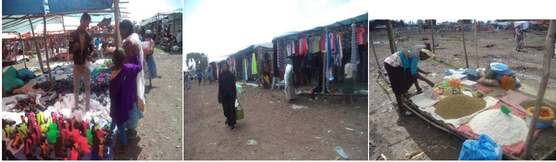
Figure 4: Figure shows durable/non-durable goods

As shown in Table 8, almost all rural households purchased durable and on-durable goods from Tulu bolo town. All respondents of households spend some amount of money for durable as well as non-durable consumable items. On average, each sample household spent 7202 Birr annually for durable items (like for clothing/shoe, household utensils and radio/tape/bed). About 31% of the sample rural households spent about 4,566 Birr for building materials. Each household had average expenditure of 785 Birr per month for major consumption goods.