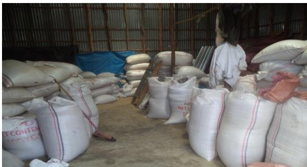
Figure 5: Crop obtaining and stored by urban merchant.

In general the hinterland was not satisfying the grain crops demand of the urban dwellers. Tulu Bolo town created linkage with other towns in the case of grain crops. However, the town serves as an intermediate market for Maize and Sorghum that were headed to Jima and Nekemte. This finding was consistent with Tegegne's (2005) result that grain marketing was of course constrained by factors such as subsistence farming.