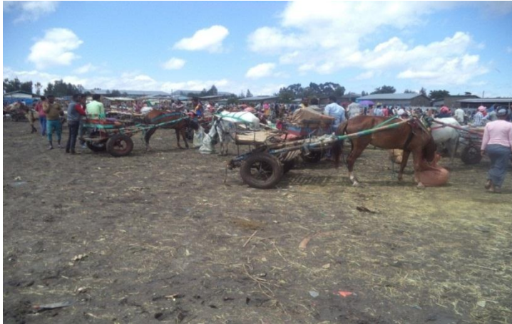
Figure 7: Rural households using animal for transporting their product to Tulu Bolo town

perishable vegetable from rural areas to the town. Rural households also need processed industrial products from the town. They transport in similar way of the resources. On the other hand, they have no electricity. Some rural areas have only the access of wireless network coverage. This study is also confirmed with empirical study of Addisu (2018).