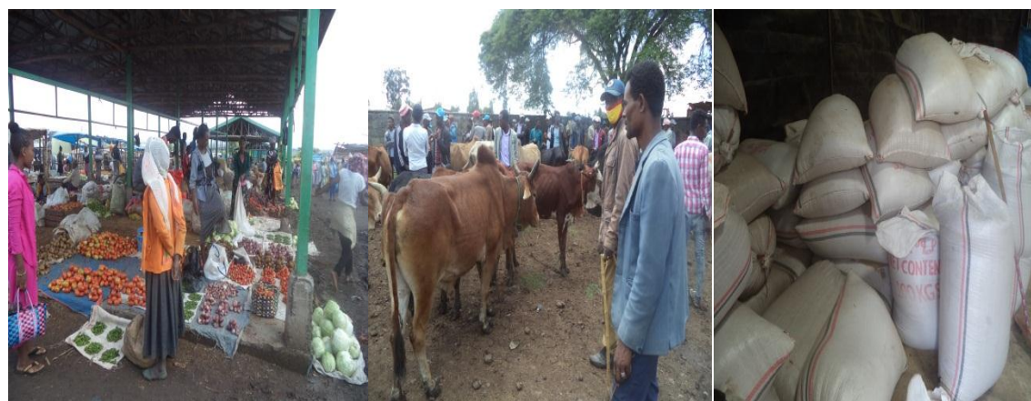
Figure 3: Market output cereal crops, livestock and vegetable/fruits.