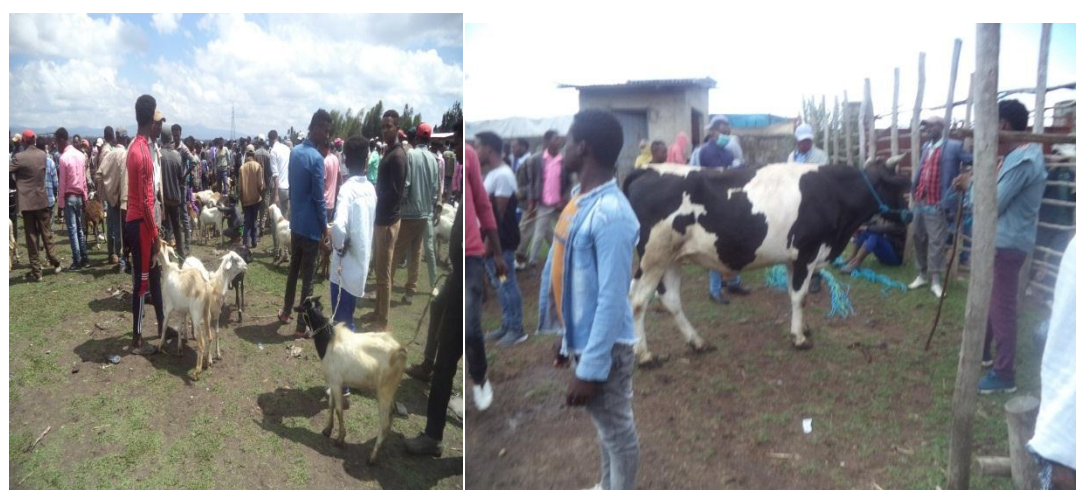
Figure 6: Livestock supply for marketing