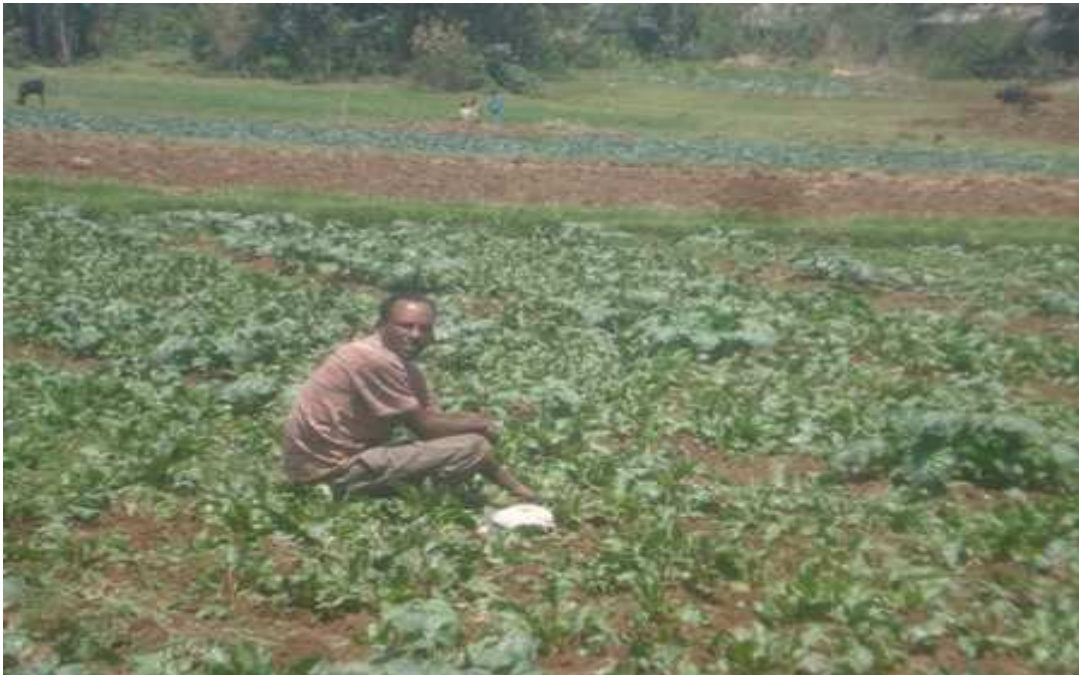
Figure 4 Low quality production because of lack of extension service