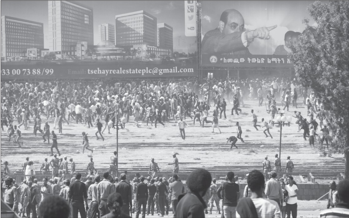
ፎቶ፡ ዜጋ ለፖርቲያው ተኮረፎ