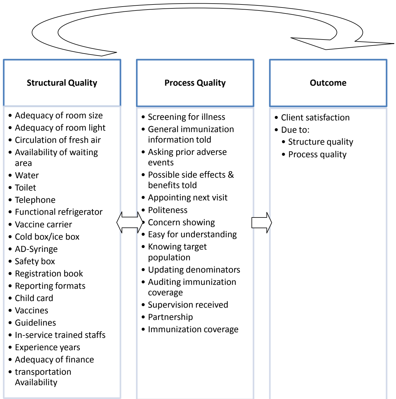
Figure 2.6.1 Conceptual frame work of EPI quality adopted from Donbedian’s quality of health assessment model (25).