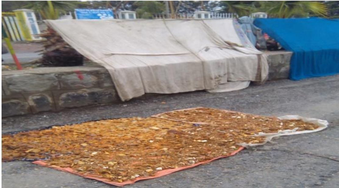
Fig4: Elder beggars drying their bulle or left over food

During my observation I observed that many elder beggars were drying leftover food ( bulle ) on the street and around the church by sun with dickey plastic.