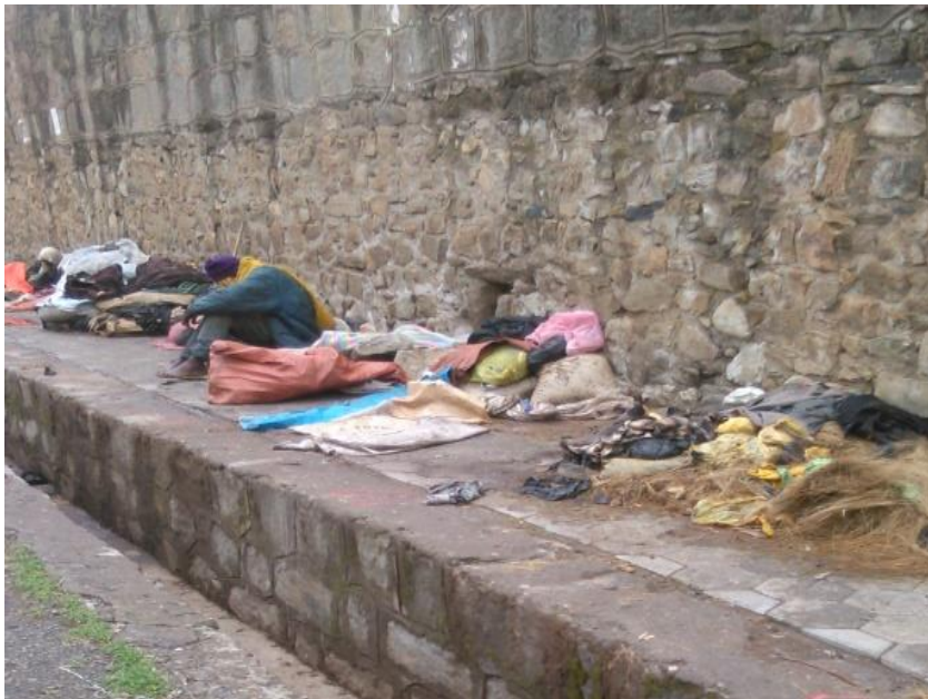
Fig3: Elder beggars sleeping on the street

However, I observed that there are many homeless elder beggars on the streets, in churchyards, in open spaces, under the tree who cannot move, hear, see, or communicate due to various manmade and natural problems.