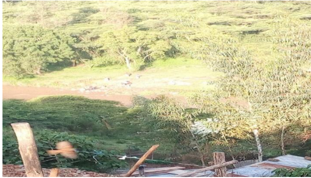
Figure 4: Corrugated-iron roof on recently built houses aimed to deceive

To make that seem to be true, they make their houses look old by painting old-looking color and using old and corrugated iron roof. A key-informant affirmed that, “ sometimes they use ashes and dusts which make the new house appear old. ”