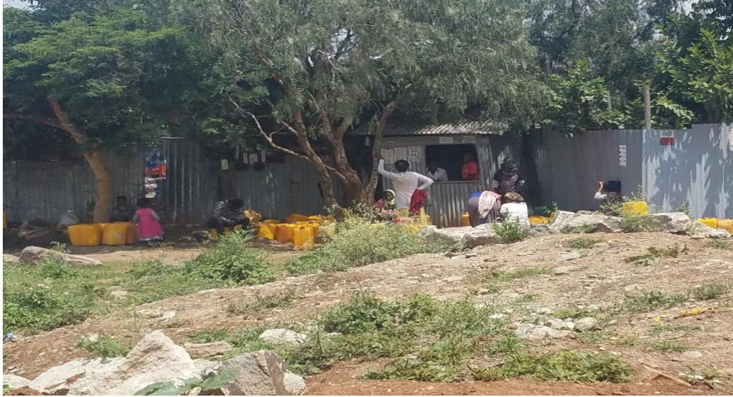
Figure 2: People waiting to get from water supply tap nearby squatter settlement