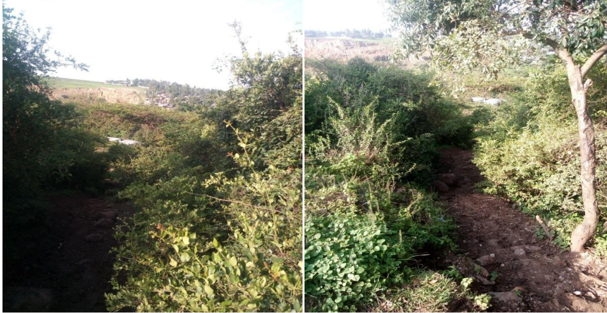
Figures 3: Narrow roads through jungle leading to the residential areas of the squatters