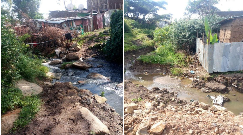
Figures 1: Dirty and smelling running water closely alongside squatters’ home

“The government has failed to manage a proper sewerage system and solid waste in the city. Our place is a complete jumble and I think we have to clean it but the problem is basically people feel that their compounds are only what matter. The whole incident of environmental sanitation is annoying. I believe inappropriate management of waste materials are the main cause of pollution in this area.”