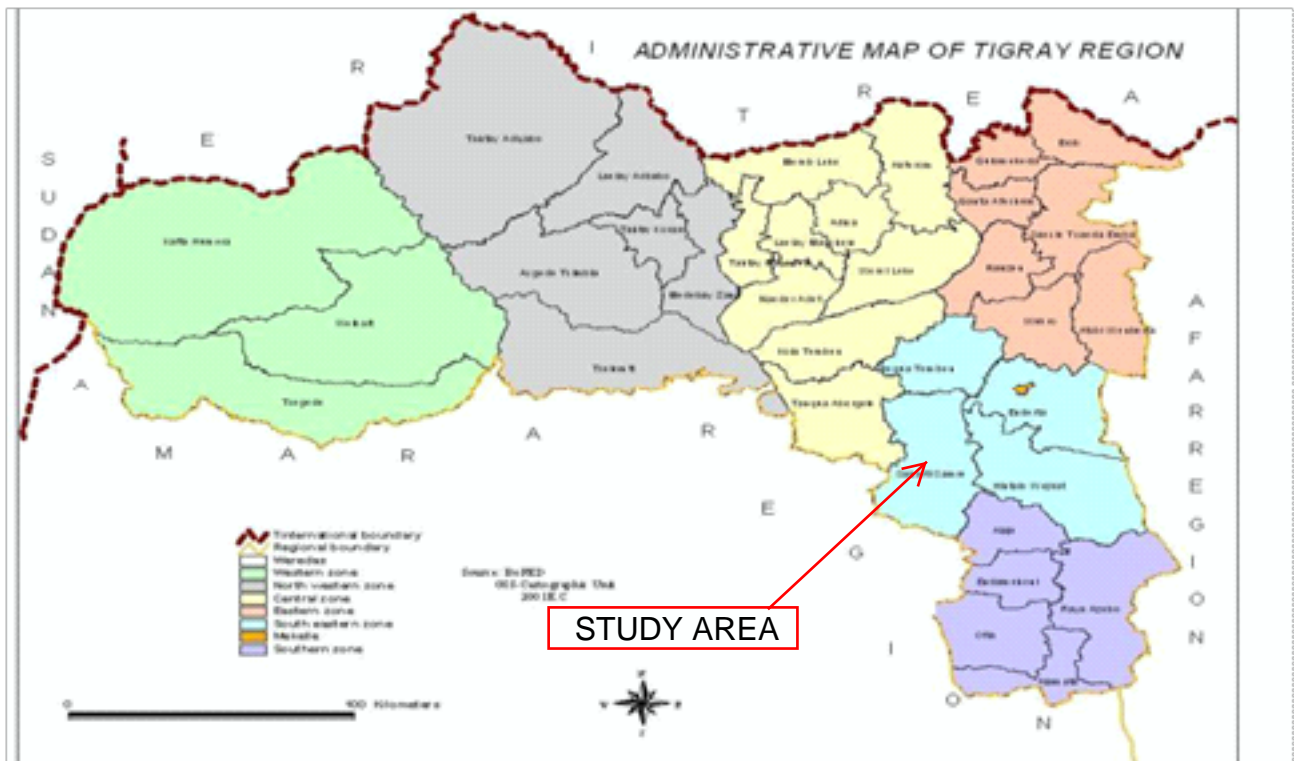
Figure 2: Map of the study area