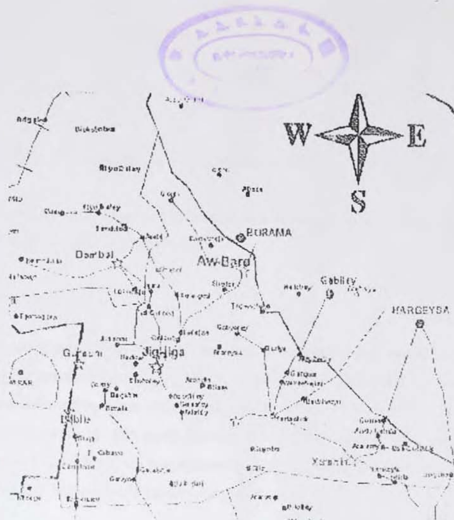
Figure 1. Map of Jijiga Zone east of Addis Ababa