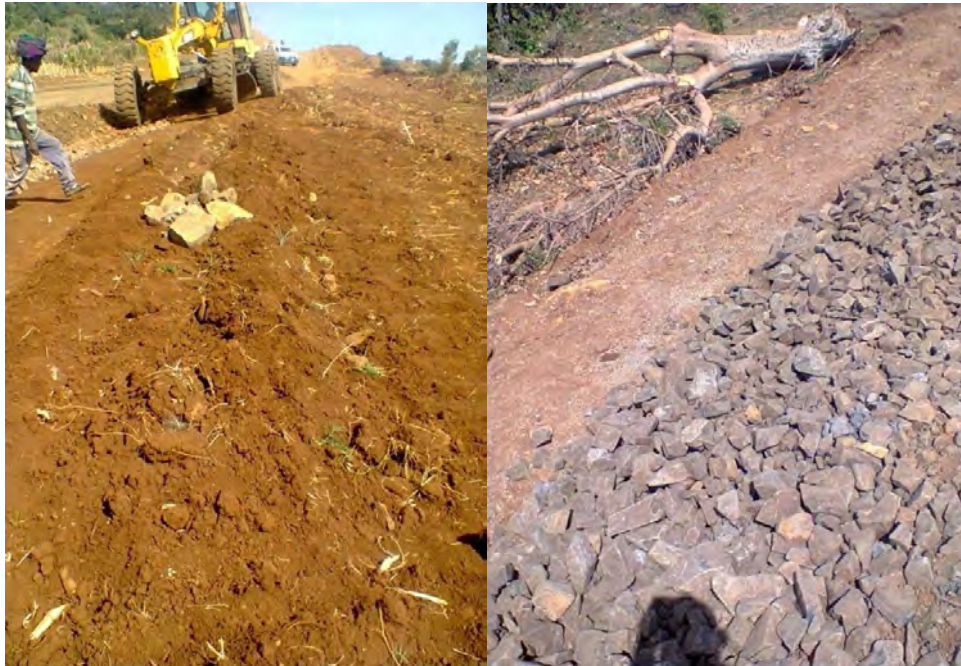
Figure 6: Human pressure on plant & soil conservation via infrastructure expansion.

According to the data collected from farmers via questionnaire the extent of giving priority to plant and soil conservation in infrastructure such as road construction was low and the extent of human negative impact by doing road construction on plant and soil conservation was about 93% responded at high.