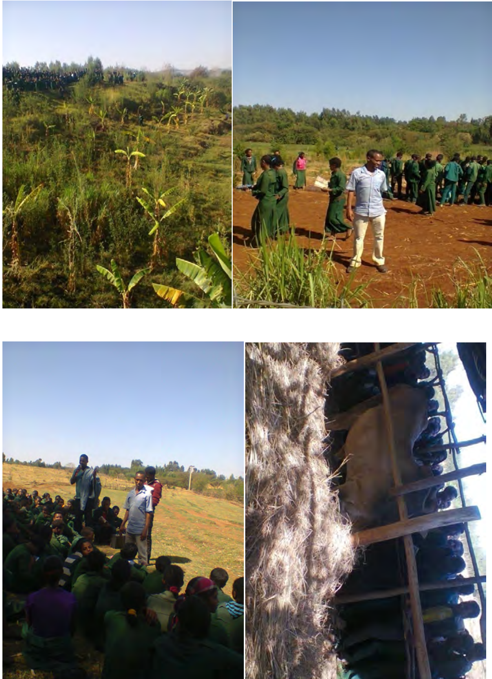
Figure .8: Positive effect of human impact on plant and soil conservation on hill slope of model Kebele