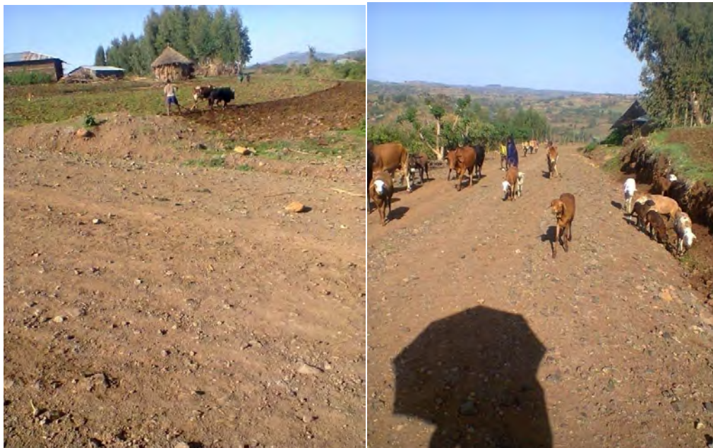
Figure 2: Socioeconomic aspect of the community

The communities living in the selected hill slope highly rely economically and culturally on animal production as well. As data collected from interview the people that live around the hill slope considered as rich, if they have high number of domestic animals that indicates culturally and psychological pressure. As has been observed and data obtained from the interview also indicates that the socioeconomic aspect of the community that live in the selected hill slope depends mainly on crop production and animal farming.