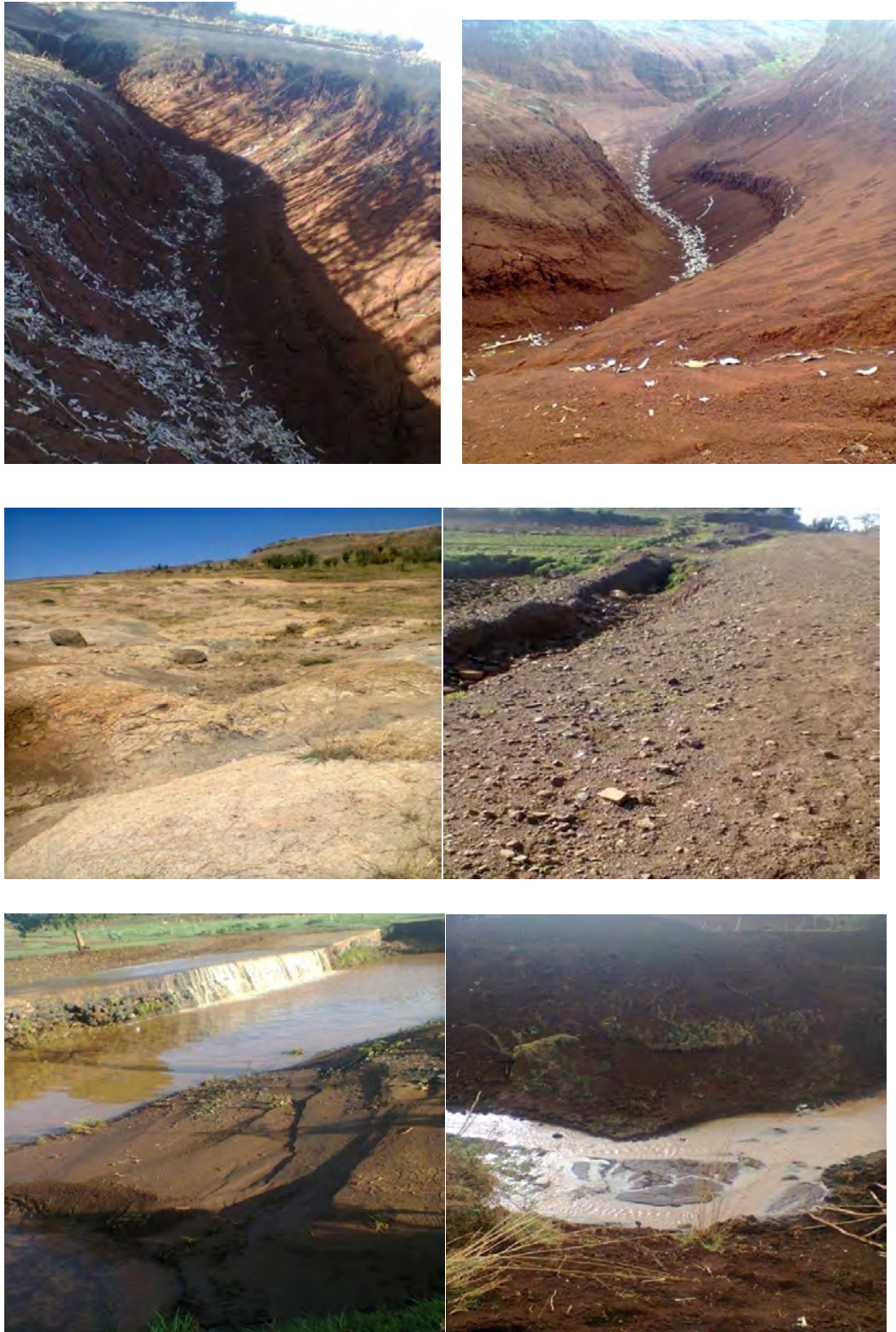
Figure 7: Extent of soil erosion from the selected Kebele