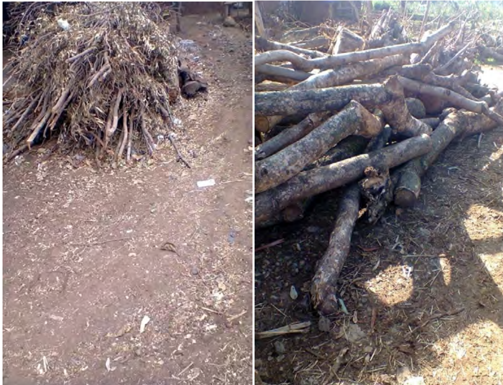
Figure 4: Human impact on plant conservation by cutting for fire and smoke.