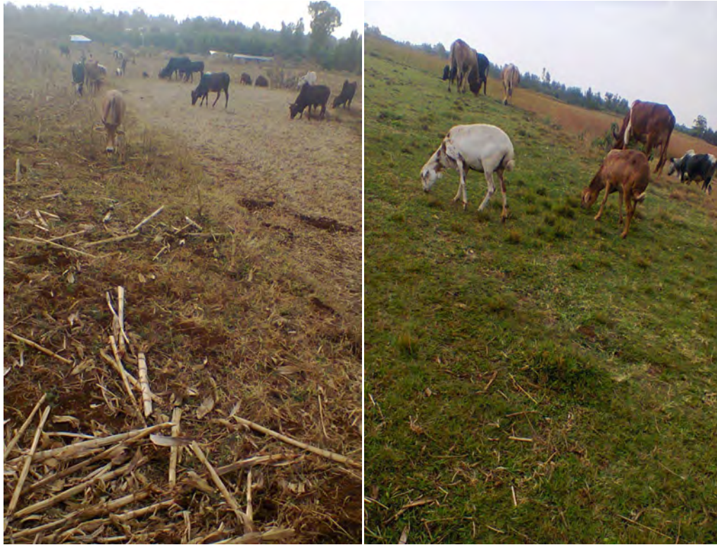
Figure 3: Free animal grazing practice