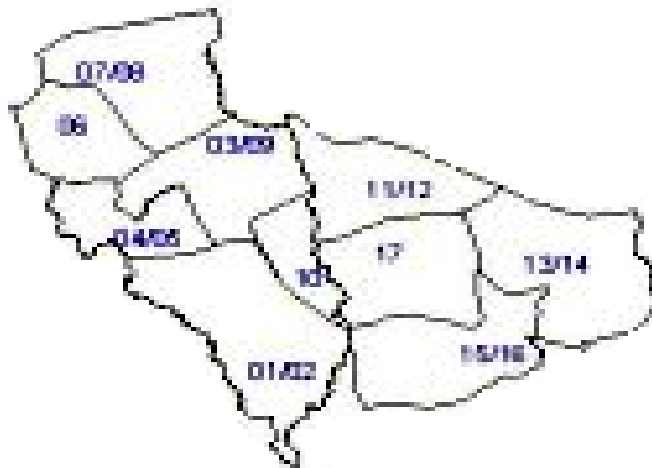
Figure 3.3: Woredas in Arada Sub-city

Sub-city's Information Bureau, Arada Sub-city possesses a total area of 9.91 square kilometers. According to the 2007 population census, Arada Sub-city had a population of 212,009 among whom 99,392 were men while the remaining 112,617 were female (CSA, 2008). Although the result of the 2012 population census was not been reported until the time this research was conducted, Arada sub-city is estimated to have more population. This part of the city was founded together with the establishment of Addis Ababa during the reign of emperor Menilik II. Therefore, it is one of the earliest settlements in the city; it has been the nucleus of the city since the establishment of the city.