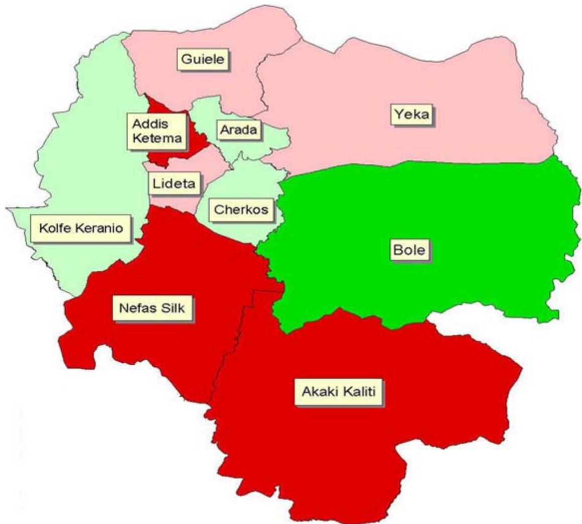
Figure 3.2: Sub-cities of Addis Ababa