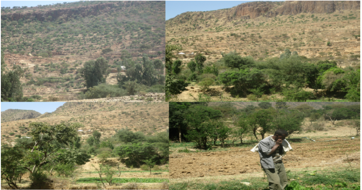
Figure 6:1: Photo January. 2013, in Adwa district

coefficient indicates that there is no significant and negative relationship between the literacy status of the respondents and perception of the number of trees as a result of soil and water conservation practices ( r=-0.093 , DF=298 , p=0.109 ) whereas it does a negative relationship between their literacy status and perception of wood production due to soil and water conservation practices( r=-0.155 , DF=298 , p<0.001 ).