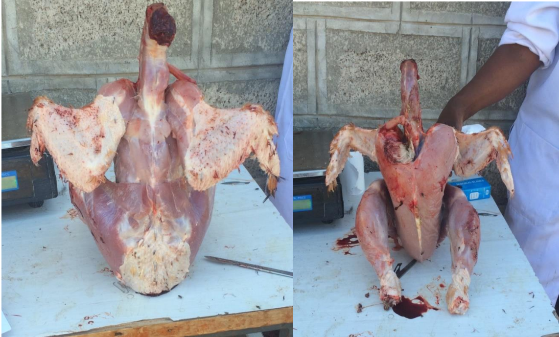
Appendix Figure 4 : Dressed Carcass Weight