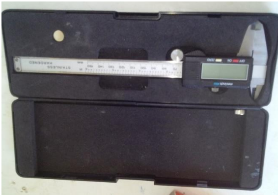
Figure 1: Digital caliper

Egg collection continued for the whole of the experimental period . At 25, 27, 29, 31.and 33 weeks. A total of 300 eggs collected from those four strains (15 eggs per treatment) i.e a total of 60 eggs at a time were evaluated for both internal and external egg qualities. The external egg quality traits studied included gross Egg Weight (EW), Egg Shell Weight (SW), Shell Thickness (EST), Shell Ratio (SR) and Egg Shape Index (ESI). The internal ones, on the other hand, included Albumen Height (AH), Yolk Height (YH), Yolk Weight (YW), Albumen Weight (AW), Yolk Ratio (YR)and Yolk Colour (YC) were determined at an interval of 15 days.Eggs were numbered first and then weighed and measured using sensitive balance. Subsequently, the length and width of egg was measured by using digital caliper.