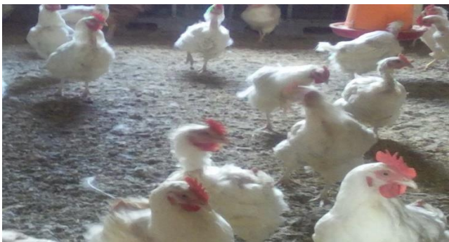
Appendix Figure 3: Novo color