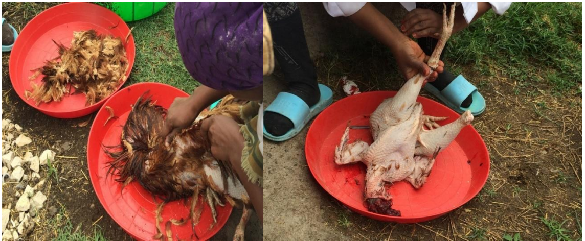
Appendix Figure 5 : Birds dry de-feathered by hand plucking,