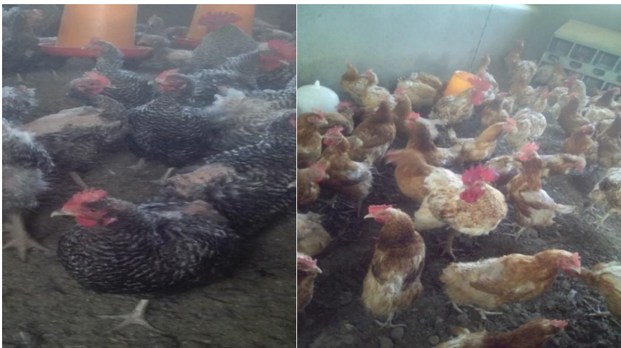
Appendix Figure 2 : Dominant Red Barred (left) and Koekoek (right)