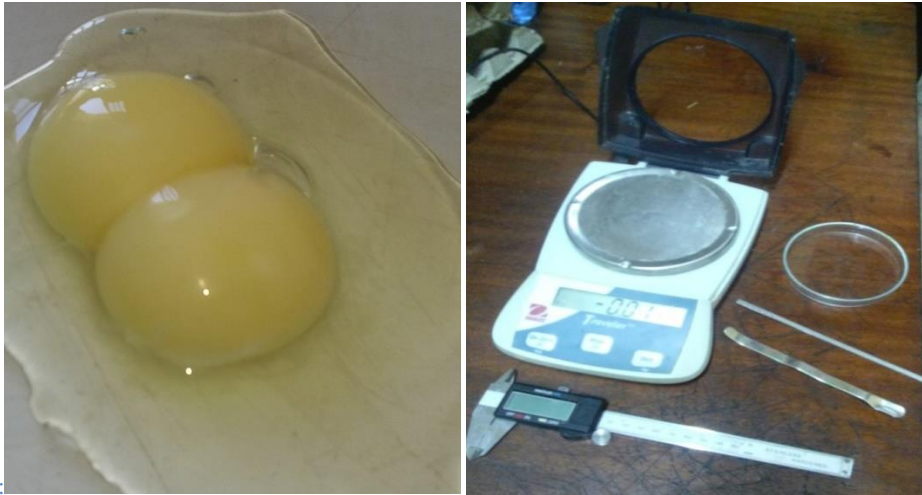
Appendix Figure 1 : Double yolk (left) and Egg quality measurement instruments