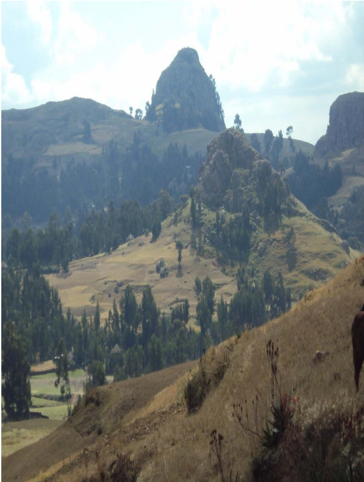
The distant view of the monastery