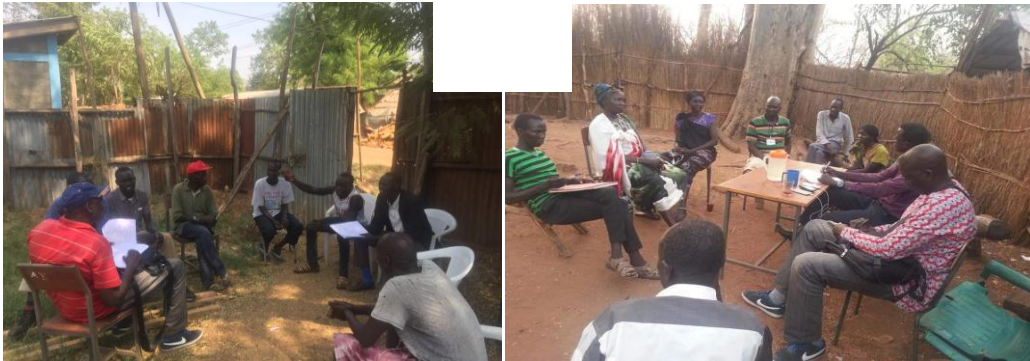
Primary school in Gambella region for both host and refugees communities