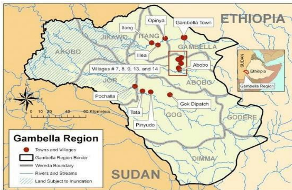
Figure 4.3: Map of Gambella region and its surrounding areas