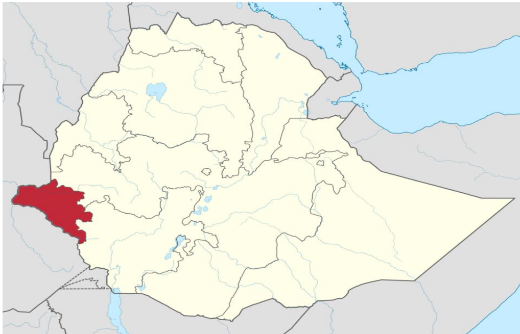
Figure 3.2: Map of Ethiopia, showing the location of Gambella region