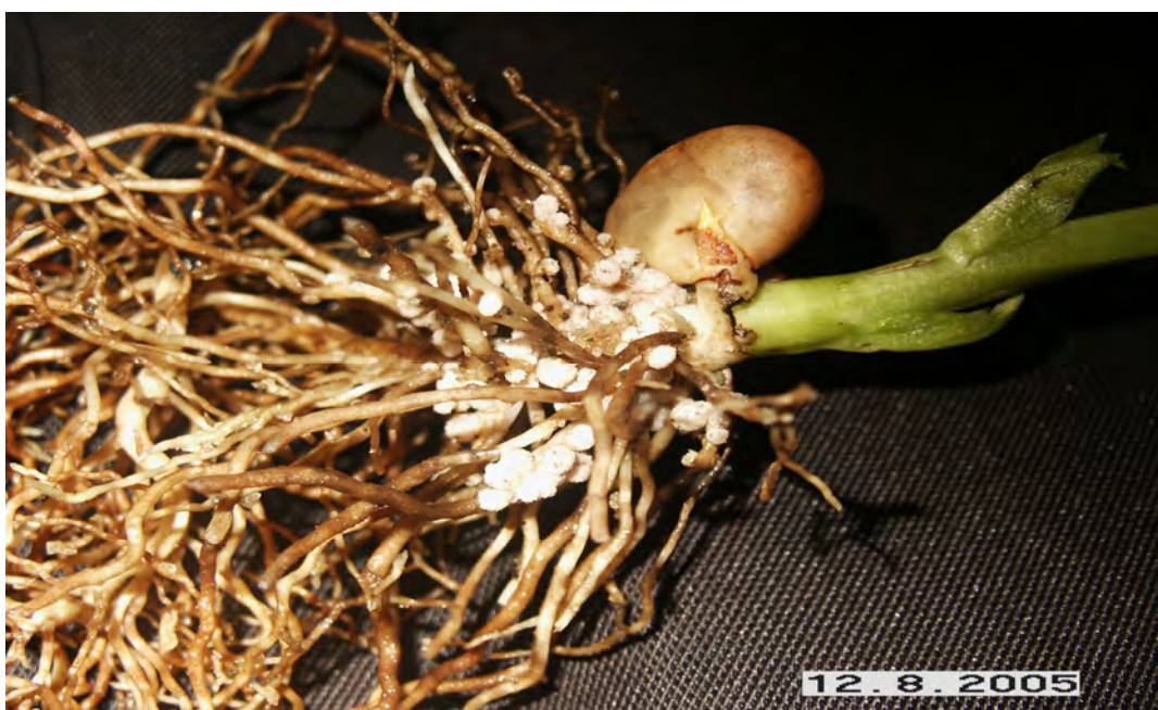
Figure 4. Showing proliferation nodulation occurring for isolate AUFR24 on sand culture