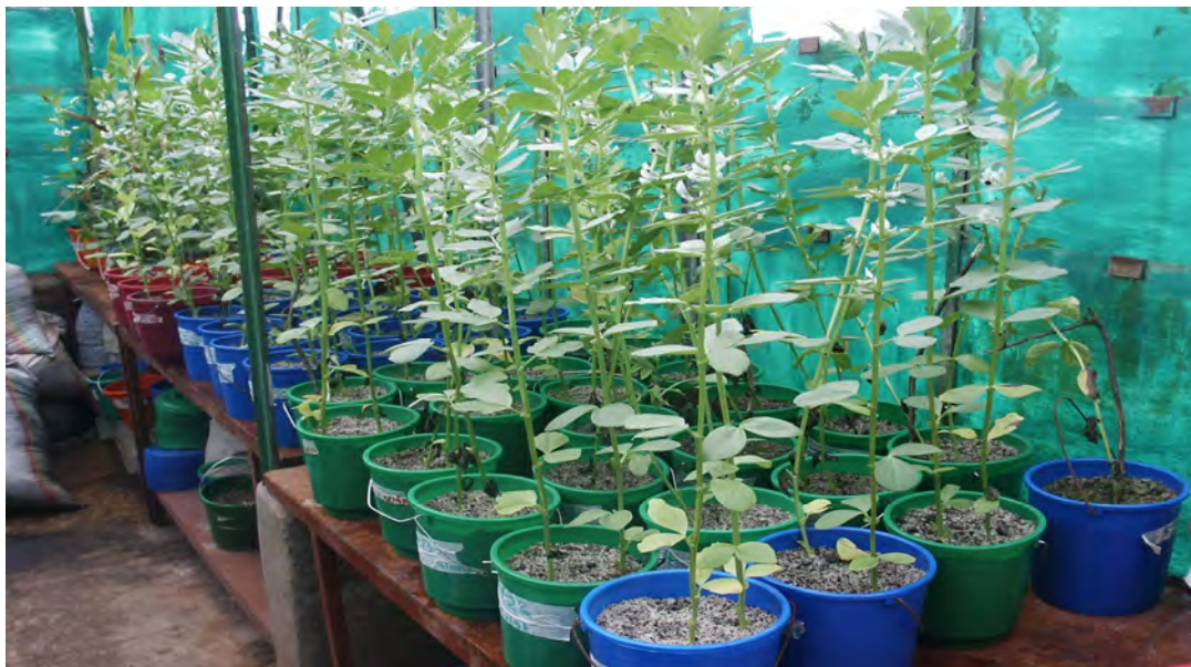
Fig.3 Showing the shoot height of the different treatment on sand culture