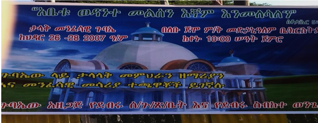
Figure 2: Poster of preaching conference organized by Preachers of EOTC