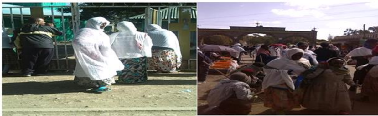
Figure 1: Church attendants of Medhanialem Church in Lebu (left) and St. Gabriel Church in Gofa (right) on the 19 th day of the month

Orthodox Christians in Addis Ababa are mostly interested in church retinue during devotional holiday. In the EOTC, each day of a month is assigned to mention saints and angels. For example, the 19th day of the month is the date of St. Gabriel, 12th for St. Michael, 23rd for St. George etc. Due to this, the number of devout attendants in an Ethiopian Orthodox Tewahedo Church is determined by the date and the name of the sainting it imply for. I observed, for instance, how the numbers of Orthodox Christians who are attending congregation on the 19th day of the month differ from one Church to another.