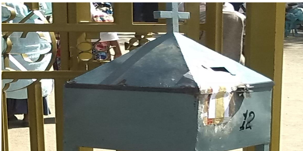
Figure 3: Mudaye Metsewat (a box used to collect money from laities of EOTC)

Perceiving religiosity in terms of religious donation has a greater importance for the Ethiopian Orthodox Tewahedo Churches to function as an independent organization. It is known that the purpose of most religious organizations is mainly related to piety. Religious organizations try to make their members to devote their time for religious purpose. According to Ewaran (2010: 4) people can contribute two things for religion; time and money. When people devote their time for religion, its importance is spiritual whereas donating money is advantageous for the organization. Money has a greater value for the survival of a certain religion as an independent organization. Currently, it is difficult to teach spiritual lessons without having sufficient amount of money though people devote their time to religious activities. Therefore, developing individuals' perception toward religiosity in terms of religious donation helps the EOTC to generate high amount of income from laities.