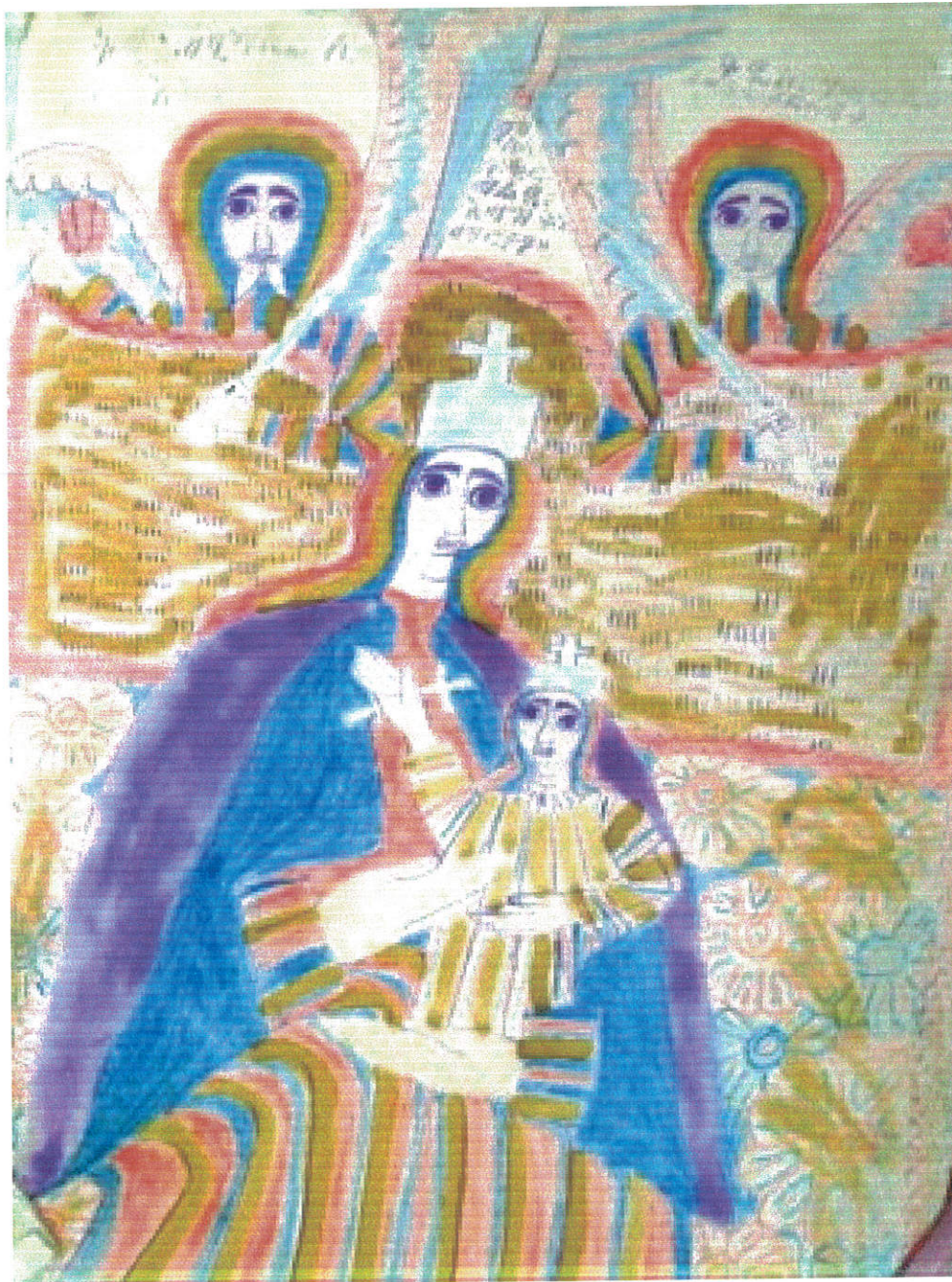
A) PAINTING OF SAINT MARY