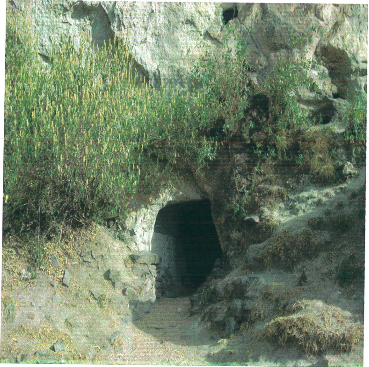
C) Monastery of Yādəba Marəyam