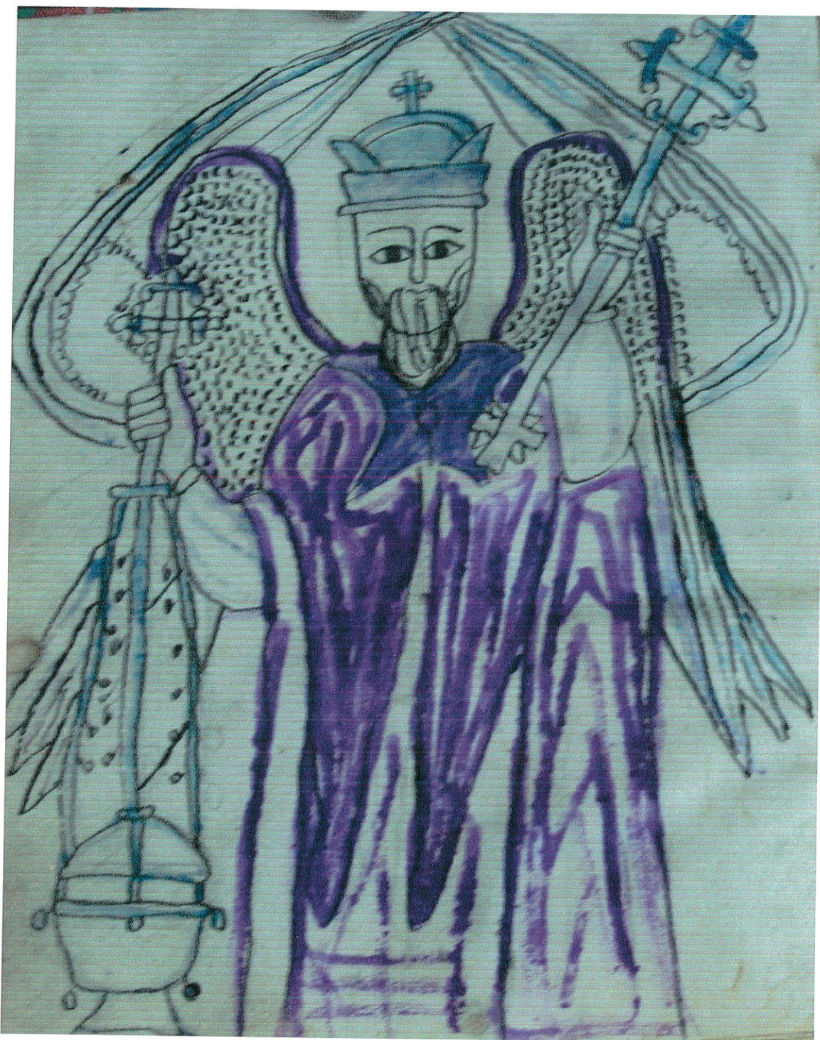
B) PAINTING OF ABUNÄ MUSÉ