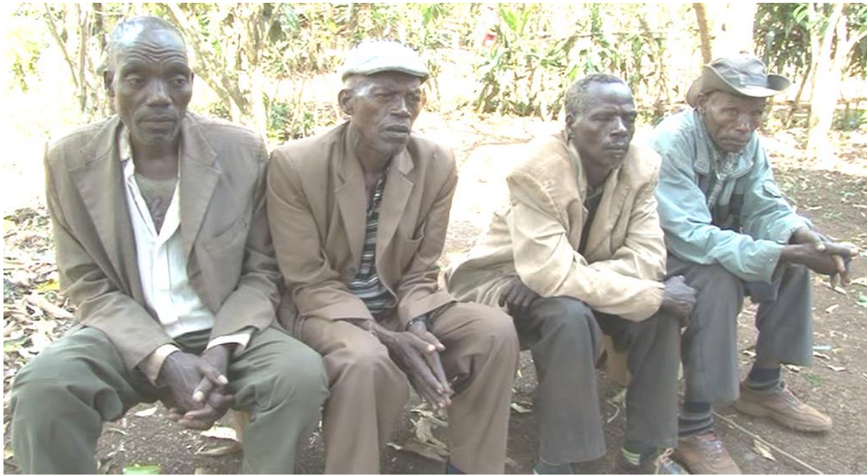
Figure_7: clan leaders who give order to the Burjab, field observation at Shosha, 2008, E.C.