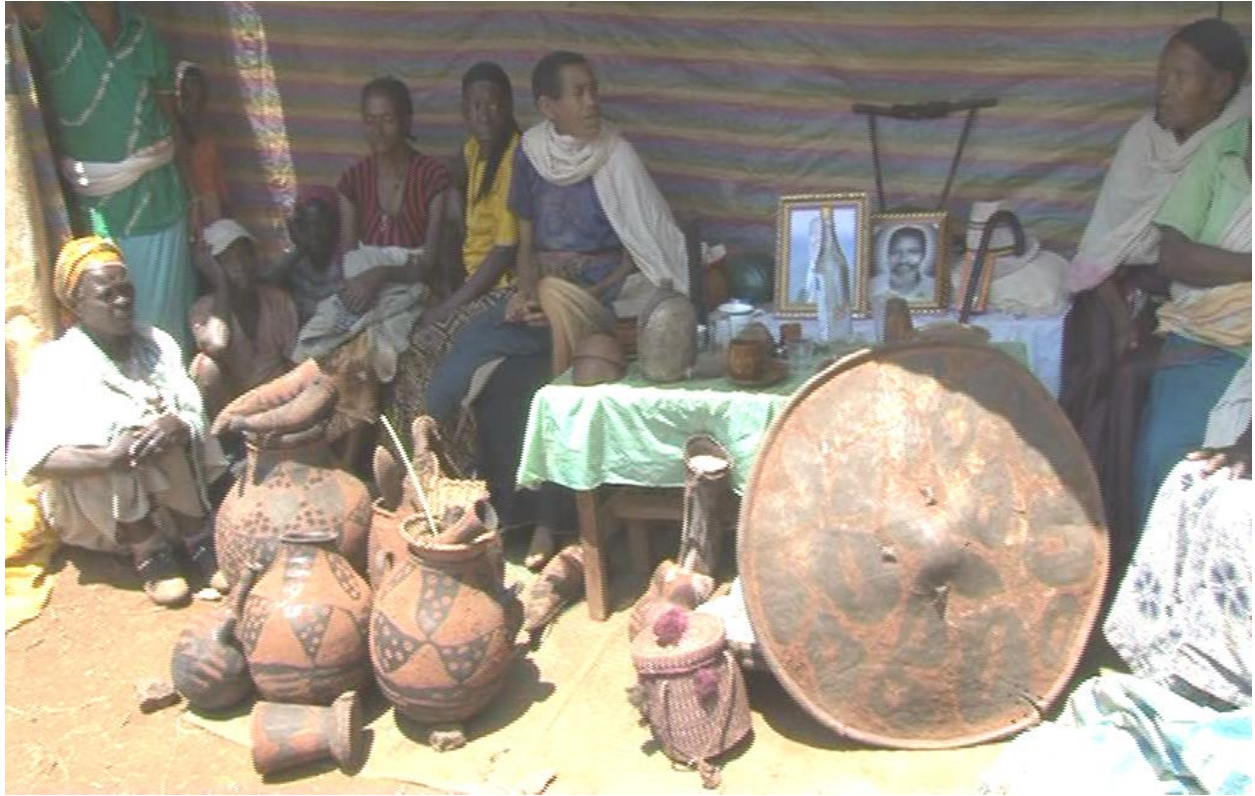
Cultural materials owned by one of the clan leaders in Shosha, picture taken in 2008 E.C