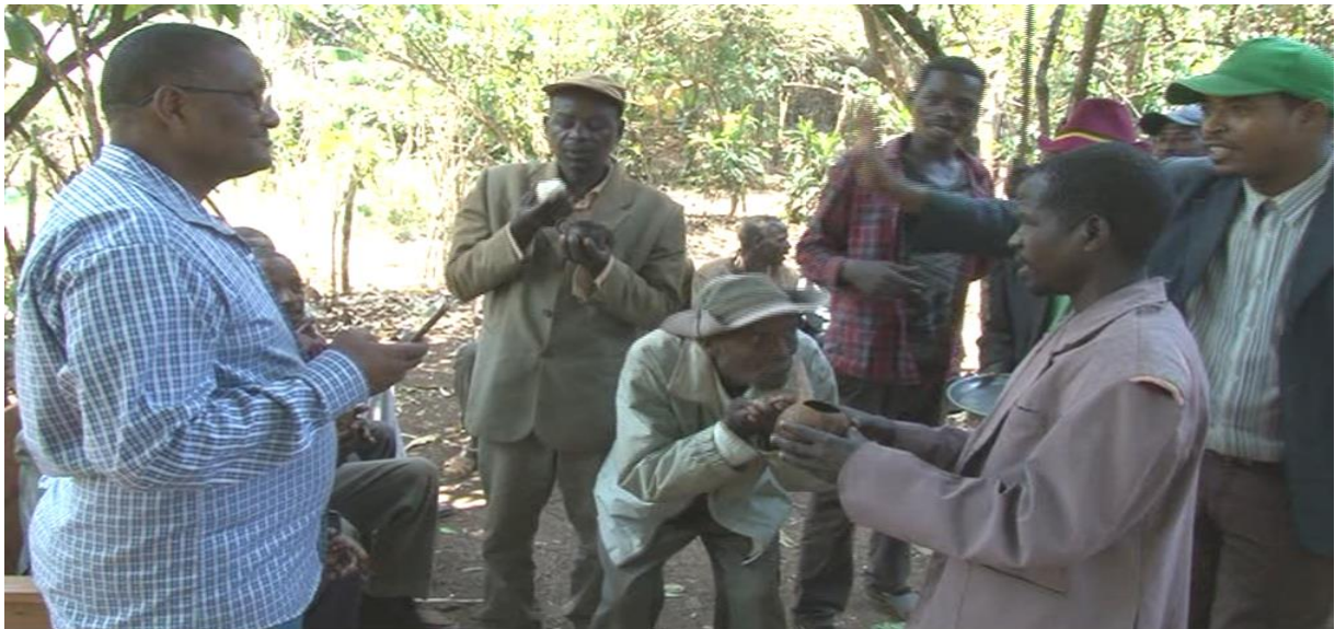
Figure.—10 -Food and drink party after reconciliation, field observation, Shohsa, 2008 E.C