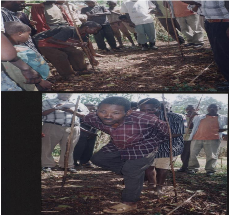
Figure.-3- Picture showing an oath being taken between the family of the killer and of the deceased

The symbolic ritual of the reconciliation process also includes not only the cutting of sheep throat and related rituals with the blood and intestine of the sheep, but also the use using different leaves, which grow in the areas as a symbol to make the reconciliation process having a long lasting effect on the behavior of the conflicting parties.