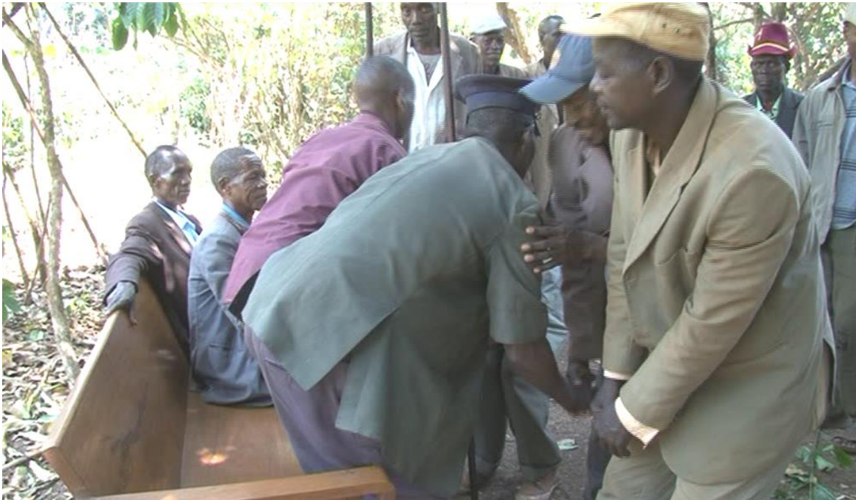
Greetings after reconciliation at Shosha kebele, picture taken during field work, 2008EC