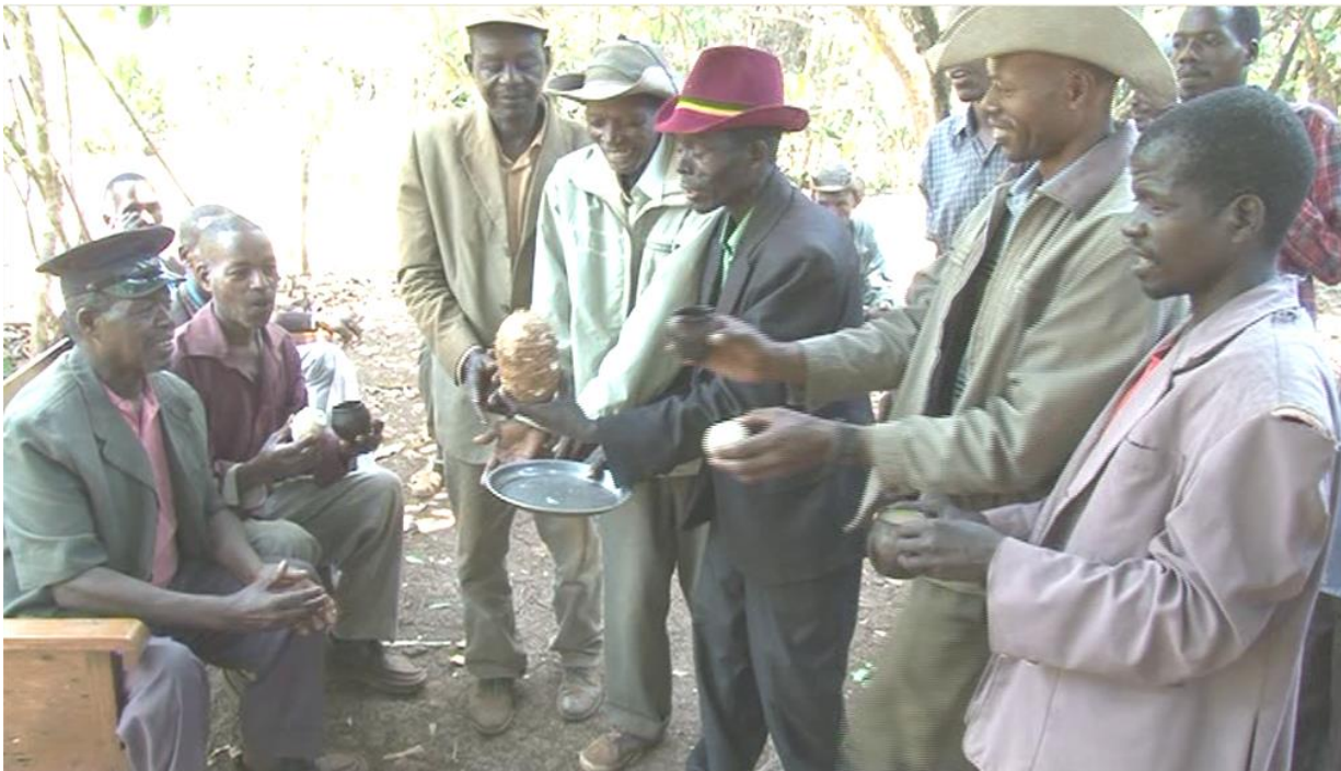
Eating and drinking party taking place after reconciliation, picture taken during field work, 2008 E.C