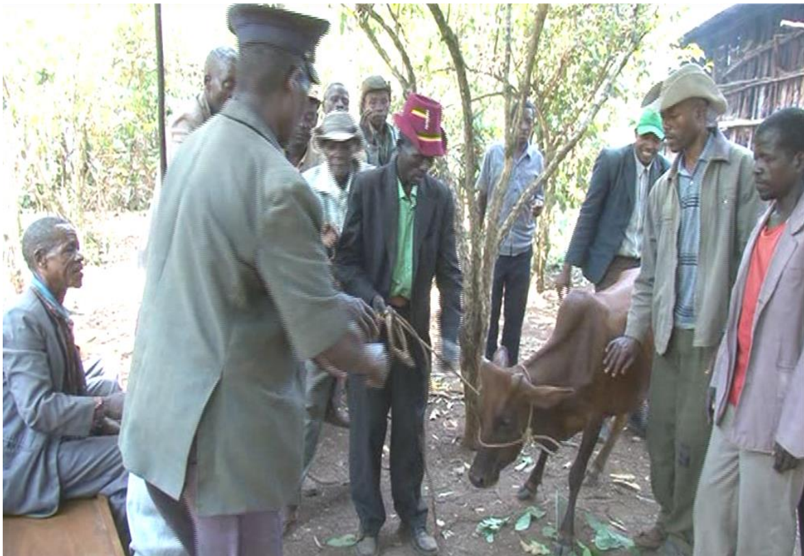
Compensation for the victim's Picture taken during field work 2008 E.C.