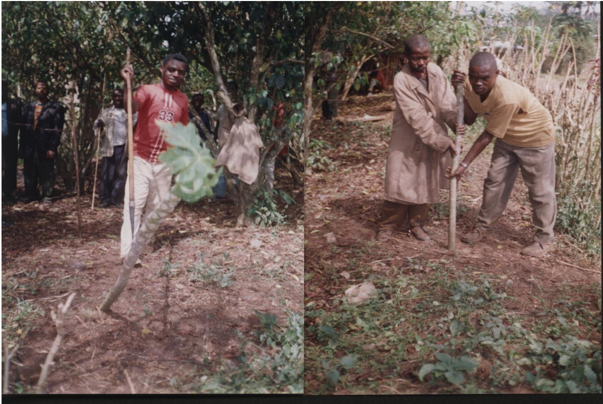
Figure 5. Picture showing while the killer commits the crime and Otsu is planted

For the second time, they set the “ Otsu ” in an upright position and members of the family of the deceased and the killer together will stitch the tree with a spear. Especially, the killer and the brother of the deceased will stitch the tree with their spears together standing face to face and finally the “ Otsu ” will be thrown into the river.