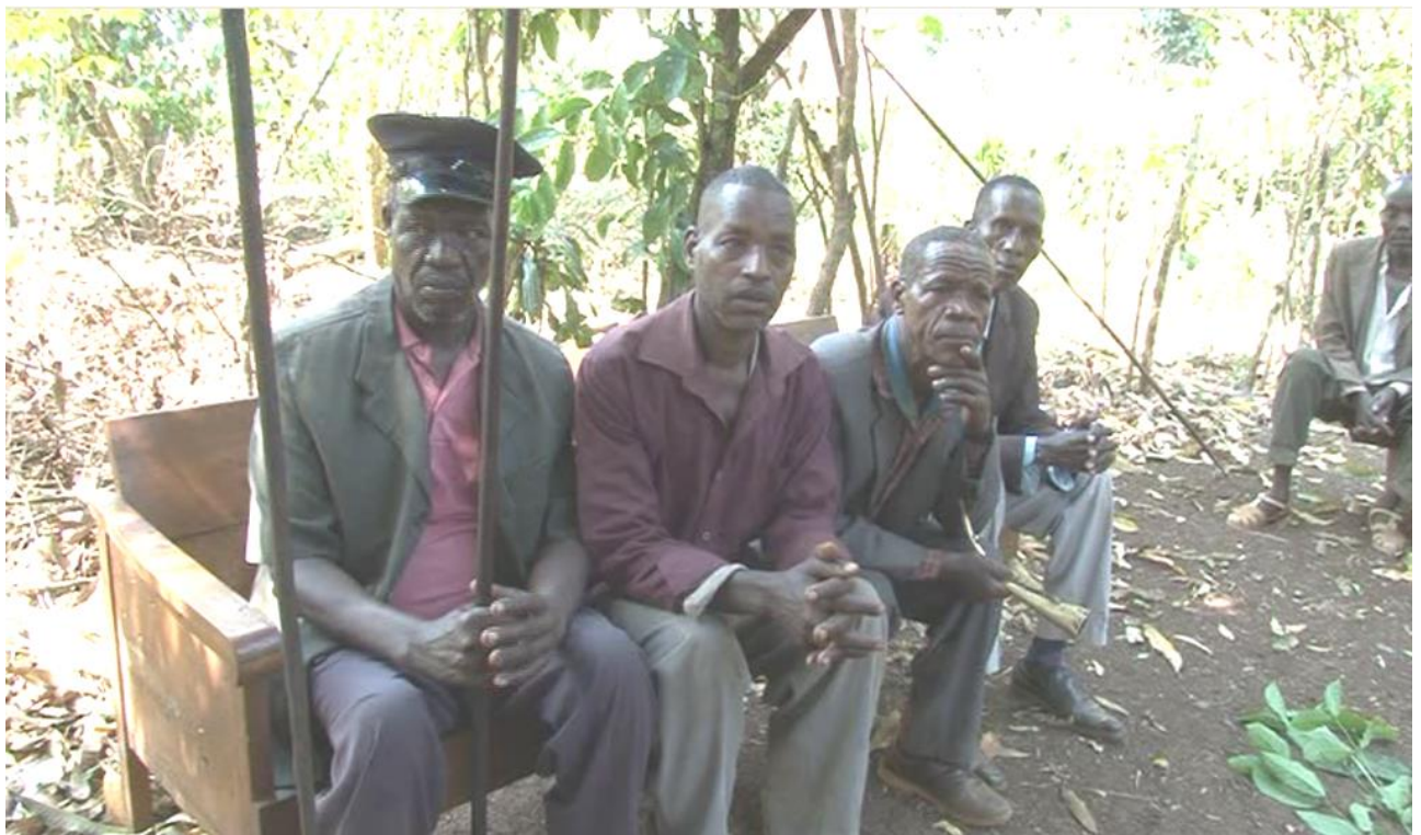
Group of Michi clan ready for reconciliation, picture taken during field observation, 2008 E.C.