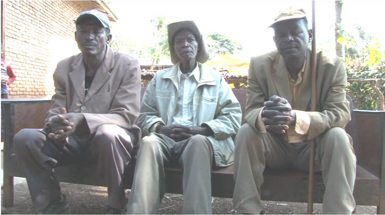
Group of Bechi clan ready for reconciliation, picture taken during field work, 2008, E.C.