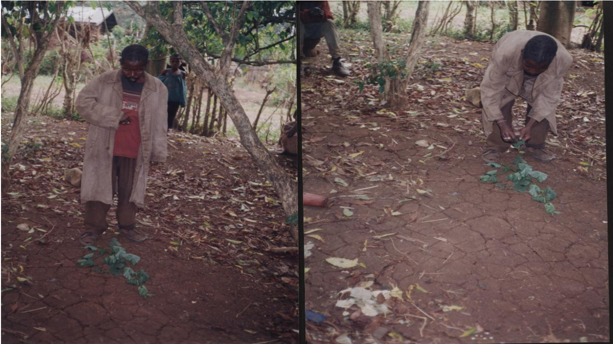
Fig 4. Kerdi plant, commonly used in the reconciliation process

One of the plants used is known as “ Kerdi ”. Kerdi is a common plant which grows in the area being dependent on the forest of the area. The plant uses the shade of big trees in the forest as a conducive environment conducive for its growth. Since the plant is protected from direct sun light through the shades of big trees, its leaves are fatty, broad in their circumference and are cold all the time.