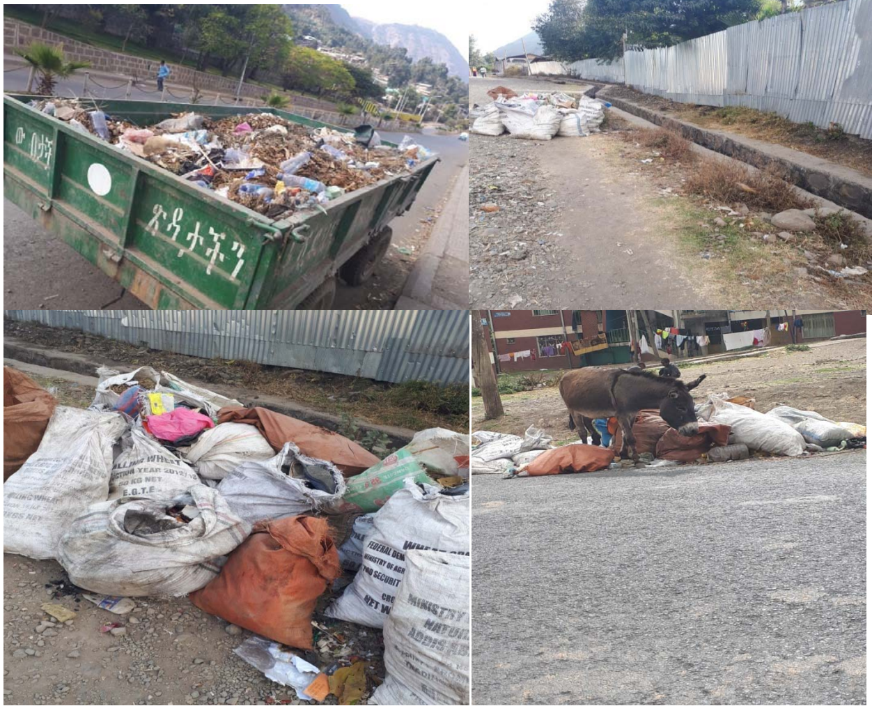
Figure 2: waste transition sites on the road