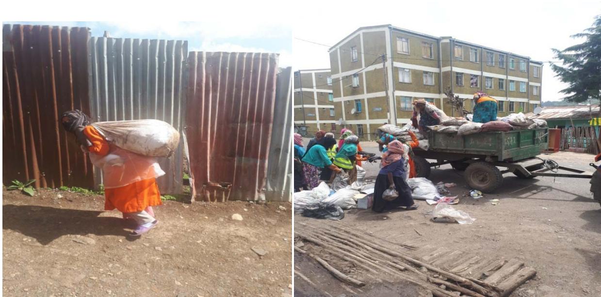
Figure7: waste collectors working door to door collection

One of the FGD participants said, “Since the car can’t come to the houses to pick up the waste, we have to carry the waste on our back, even if it is from Tossa (Tossa is a big mountain found in Dessie town), up to the road.”