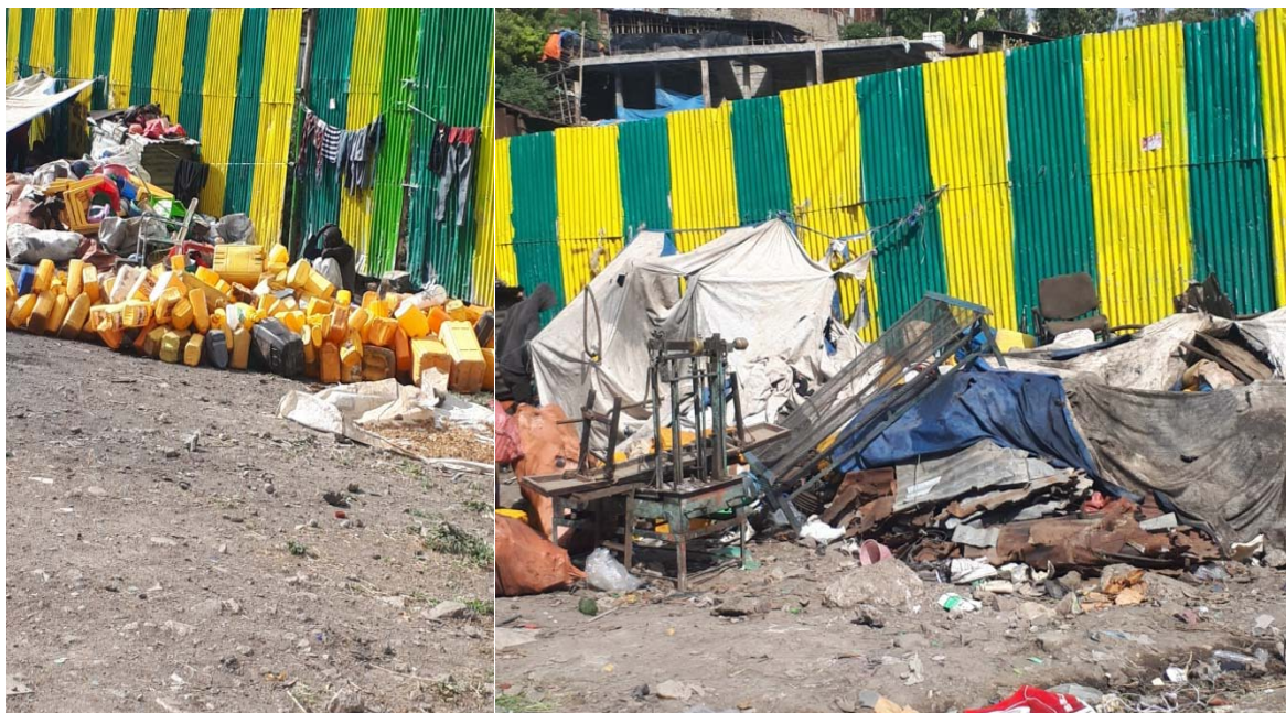
Figure:6 a place where separated waste items are bought and sold