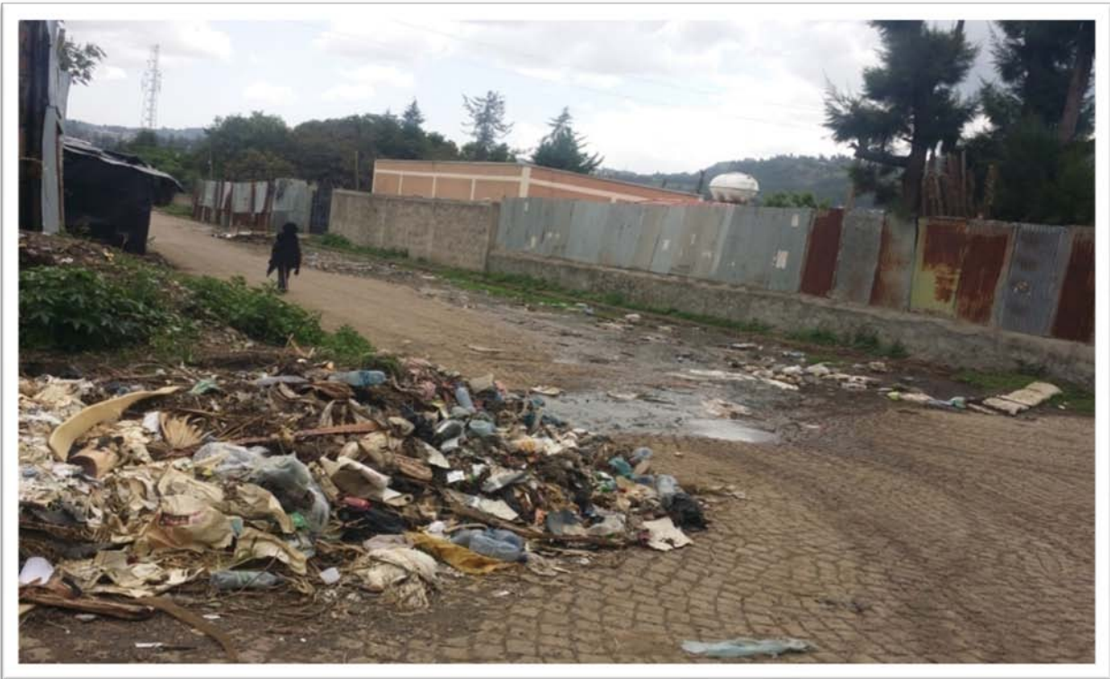
Figure8: waste dumping irregularly

The study tried to triangulate the responses from the survey data, the interview and the FGD data to trace the main responsible body for the existing problems of solid waste management despite the fact that there was a system created for household solid wastes to be collected door to door. According to the observation made, the researcher was able to see there was gap in the waste management system because (see pictures taken on site below on figure ) there was a water concentration on some places; water drainages tubes were filled with solid wastes, deification on plain sight and dumping on plain sight were commonly seen and the town was clearly not hygienic enough. Therefore the researcher raised the questions to trace back the source of the problem for all the respondents and finding the responsible body for the existing problem. The respondents mentioned the following parities as responsible for the existing problem