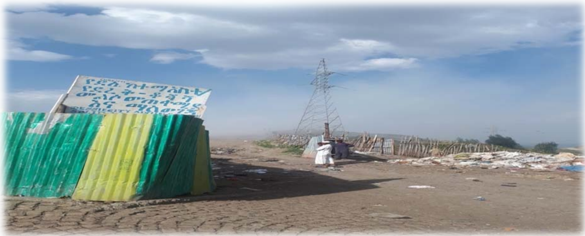
Figure 4: The Menber Tsehai waste dumping sight

“There is no gas ... the municipality knows nothing ... it did not burn like this before, it's the children collecting metals and nails to sell, they purposely bring matches and kerosene and set the waste on fire, that is how they make a living.”