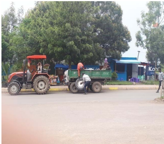
Figure 3: waste collection and transportation practice

unhealthy and unpleasant to see. According to the interviews and the FGD data, the waste was not collected on time because of two main reasons. First, the collecting truck (tractors) were not ready or available to pick up the waste on time because they were small in number and they got broken all the time and second the places where the waste collectors put the waste sacks were already known by the community members and, therefore, even after the truck picked up the waste and left, some people would bring and leave their waste on the same place so that it would be taken on next round.