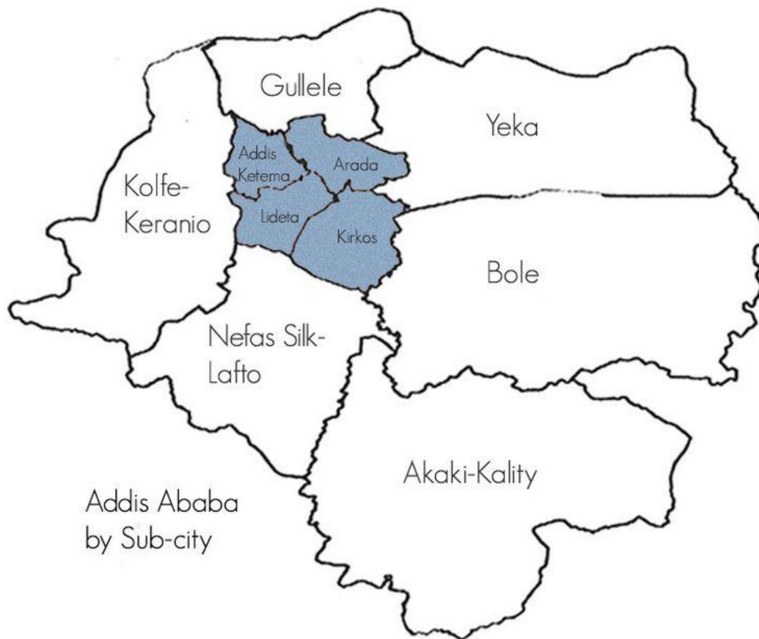
Figure 3: Maps of Addis Ababa

either committed intentionally or negligently, aggravated robbery, aggravated fraudulent misrepresentation, etc. Among these the researcher is interested to scrutinize intentional homicide investigated by AAPC Homicide Investigative Unit. The target group of this study is those suspects detained in Addis Ababa Police Commission for committing intentional homicide.