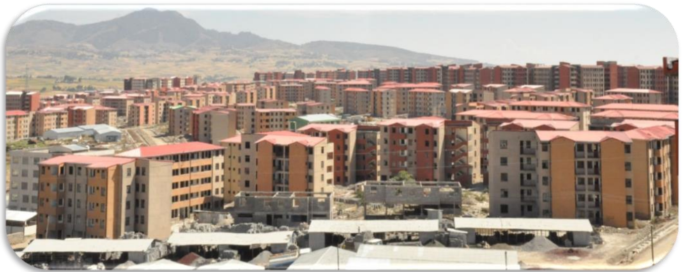
Figure 3: Bole Arabas 2 project site