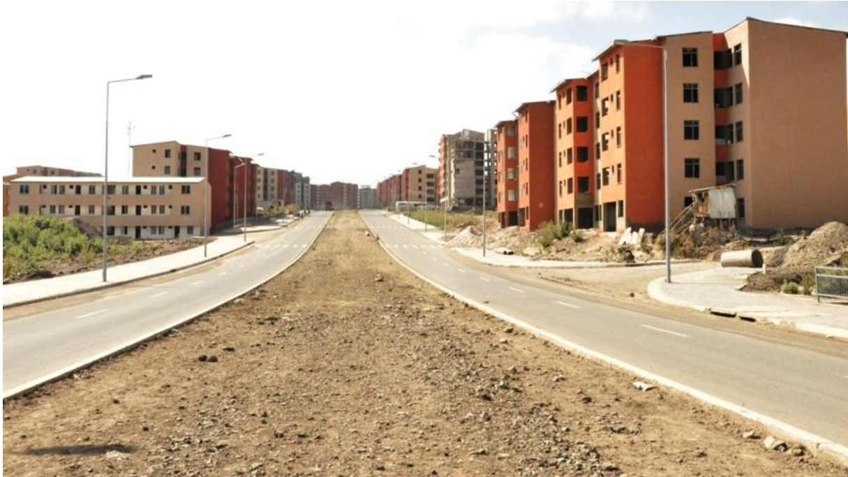
Figure 2: Bole Arabas1 Project Site