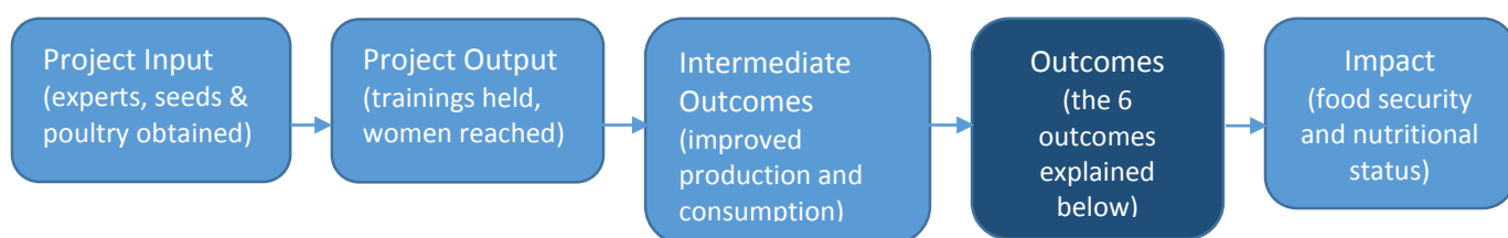
Figure 1. Project result chain (NSA intervention) (FAO, 2012)

In the simplified impact pathways, six outcomes to agriculture and nutritional interventions are specified. These outcomes include on-farm availability, diversity and safety of food, food environment in markets, income, women’s empowerment, nutrition knowledge and norms, and natural resource management practices. The realization of these outcomes would result in improved diet and health, with ultimate positive impact on food and nutrition security (Herforth and Ballard, 2016).