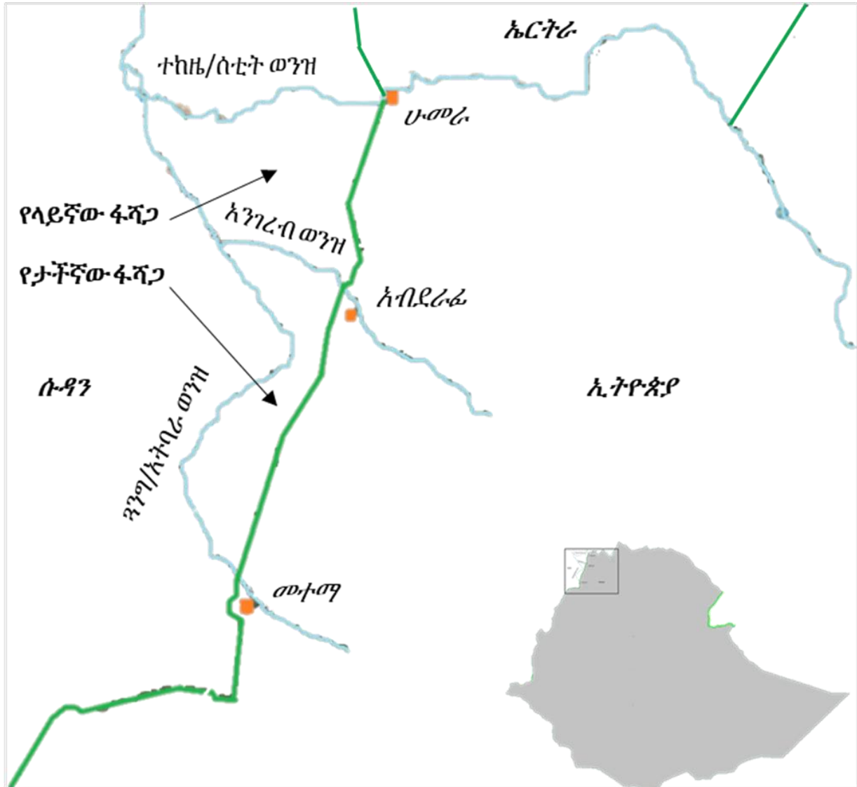
• Figure 3.1. Map showing disputed area between Ethiopia and Sudan

The disputed border is found on the sector of the North of Mount Dagleish to Setit River, including the al-Fashaga area (situated between the Atbara and Tekeze River) in the North Western part of Ethiopia and in the Eastern part of Sudan, which is known for its very fertile agricultural land.