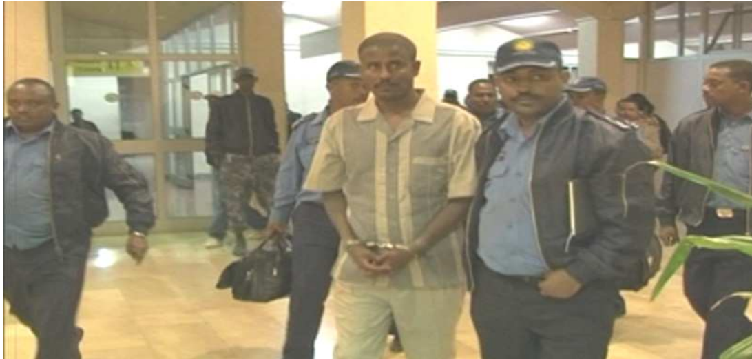
Figure 1: the criminal captured in South Sudan, returned to Ethiopia

Ethiopia and made to appear before court. Here, the involvement of the Interpol and south Sudanese government communicates that different countries are committed to controlling and preventing crime together.