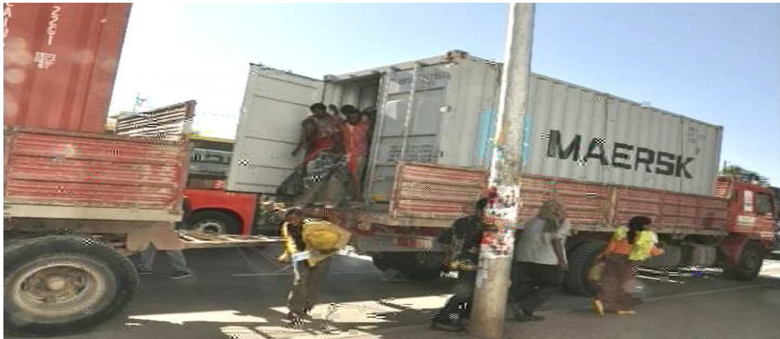
Figure 3: Image of emigrants in the container

An example of dark journey could be the case of travelers captured in Afar region, Ethiopia while travelling through Djibouti, and then planning to Yemen (program transmitted on February, 19 and March, 4/2012). It was a crime in which so many individuals died and seriously injured. The emigrants were seventy seven (77) people who started traveling in the midnight at about seven O'clock (7:00) local time, being enclosed in the container, large metal box used for transporting goods, (see the figure below and Appendix, A: 10). The media portrayed the action as a serious criminal act in which human beings were treated as commodities.