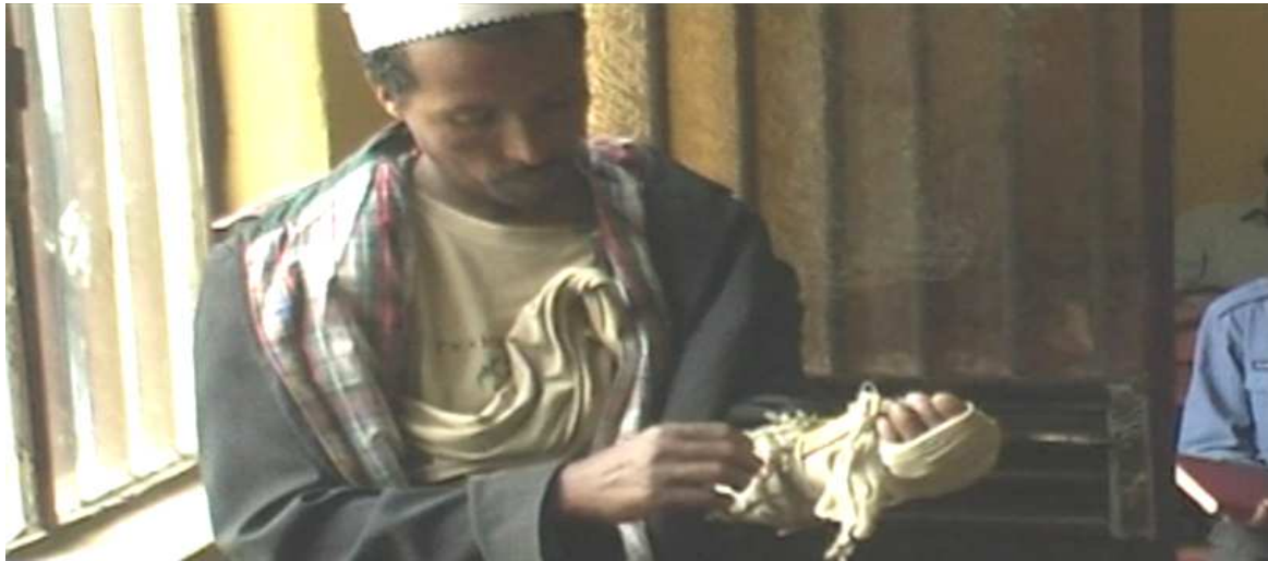
Figure 4: Image of criminal used different signs to deceive people

In the same area (Arsi zone), similar deception with signs happened. The criminal introduced himself that he came from South Gonder, Amhara region. Entering the Muslim's Mosque in Shashamane town, he deceived the Muslim's that he has been hit by his families because of changing his religion to Muslim. He used to wear clothes that reflect Muslim culture including hat and scarf (see Appendix, A: 12). His choice of religious subject for deception is a signifier of people's proximity to religious matters that he thought to be simply supported by those people who follow the religion of Islam.