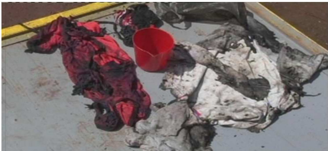
Figure 2: Clothes of the victim burned with chemical/acid

The image you see below is a victim's clothes which are burned with acid. There is a jug placed at the center of the burned clothes. One can interpret from that it is a material by which the chemical was poured onto the victim's body. The size of the jug can communicate what amount of acidic chemical it can contain and how much it can destroy human bodies. The clothes are also signifiers of what has been happened, and denote the bitterness and potential of the chemical to burn. At a connotation level, it can signify to what extent the victim was hurt.