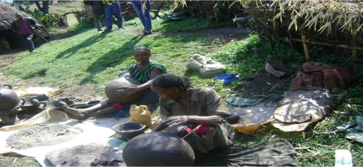
Figure 1 While Fuga women making pots