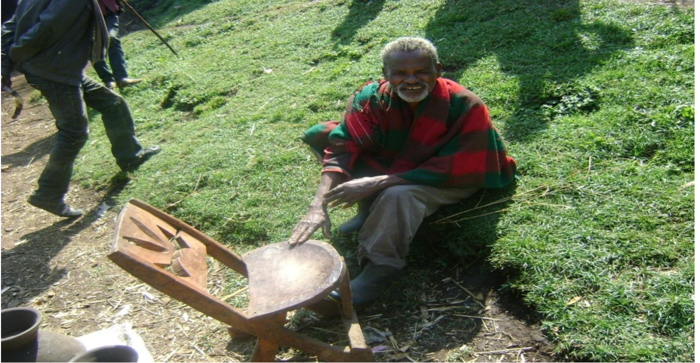
Figure 3 Fugaman working a chair