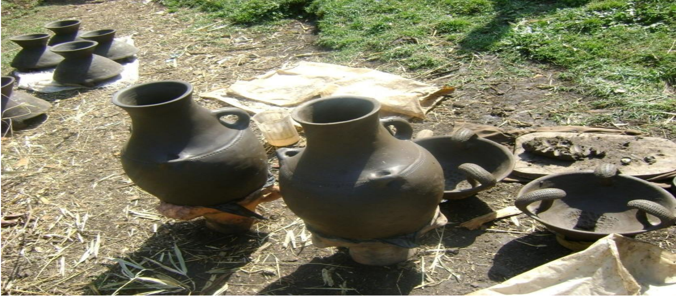
Figure 2 pottery products