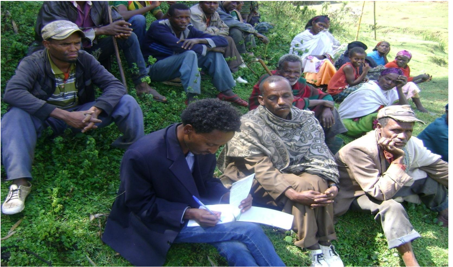
Figure 4 Focused Group Discussions with Fugas at Buyama Dalfo