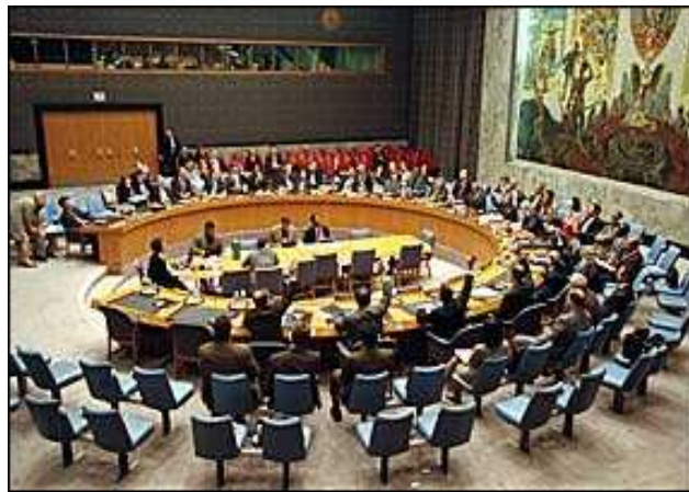
Figure 1_ Typical Photo of UN Security Council

This chapter consists of four sections. The first is overview of the Security Council highlighting the historical background of the Council followed by functions and powers of the Security Council in the second part of the chapter. The third section deals about reforming the Security Council basically reviewing the main problems that caused the need for reforming the Council raising the background of the Council, veto power, non-participation of UN member states in the Council's decision making, lack of transparency in the Council's meetings and US hegemony. The fourth portion which is the last part of the chapter reviews the proposals submitted to reform the Security Council within two sub-sections: the 2005 Reform Proposal and UN member states reactions.