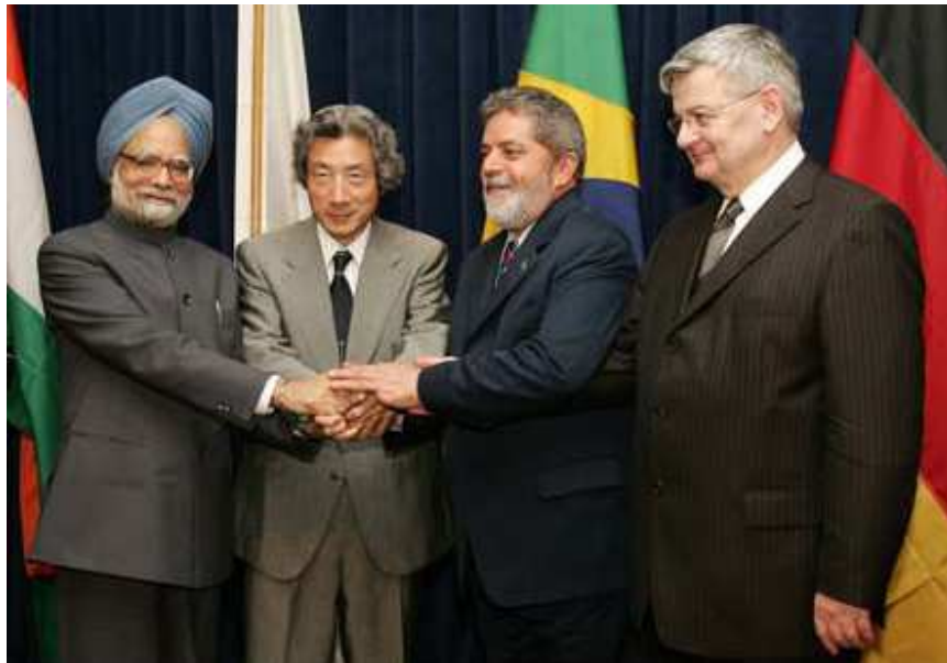
Figure 2_ 21 September 2004, Indian Prime Minister Manmohan Singh, Japanese Prime Minister Junichiro Koizumi, Brazil’s President Luiz Inacio Lula da Silva and Germany Foreign Minister Joschka Fischer meet in