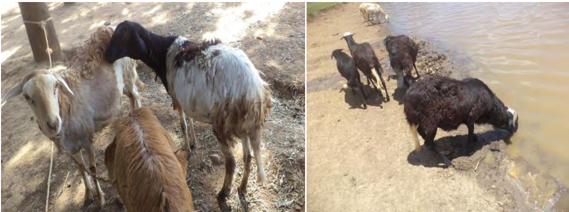
B) 25% of Dorper sheep breed tethered with tree and watering from pond in Wolaita