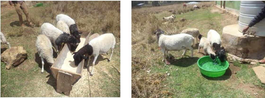
Figure 2: A) 50% Dorper sheep breed feeding and watering at FTC in Mirab Azernet

Sheep are housed in different ways. The majority of the respondent in Mirab Azernet (95.8%), house their sheep in the separate house and housing sheep in main house was also reported by some farmers in the same woreda. However, the all respondents of Damot Gale and Damot Sore woreda (100%) house their sheep in the main house with families.