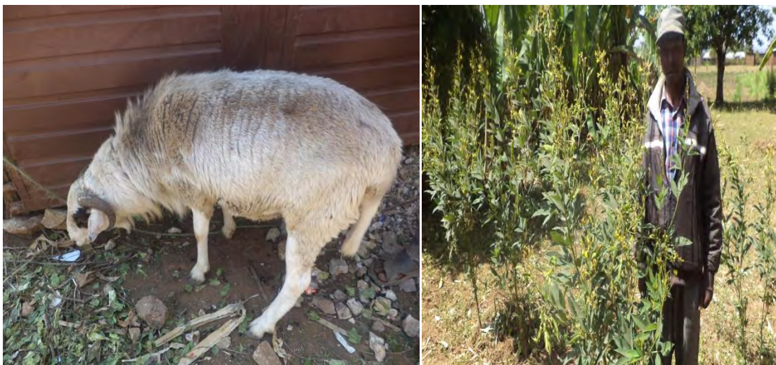
D) One year old 50% Dorper sheep ram feeding chat leftover in Mirab Azernet