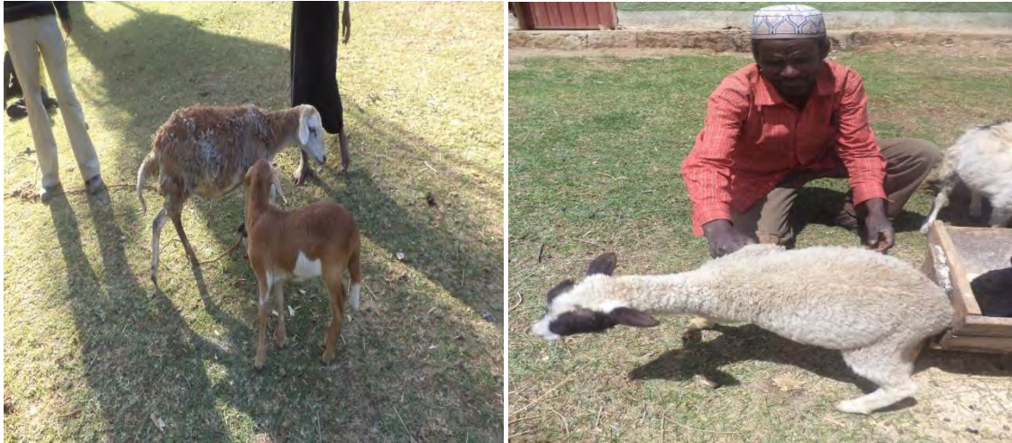
C) 25% of Dorper sheep offspring (2.5kg) and 50% of Dorper sheep offspring (4.5kg) of one month, to reflect blood group difference in Wolaita and Siltie left to right