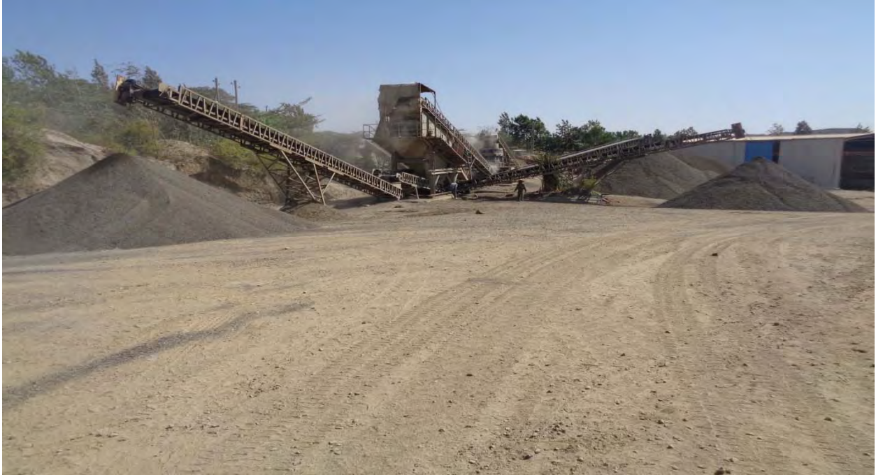
4.4b Aggregate production plant