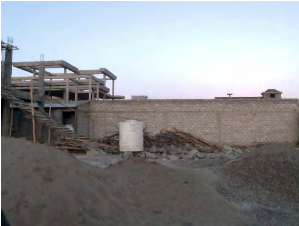
Figure 4.6b: Handling of Aggregates in Construction Site