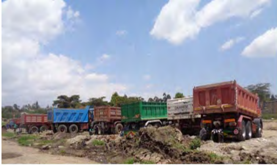
Figure 4.3: Supply of fine aggregate at Kality