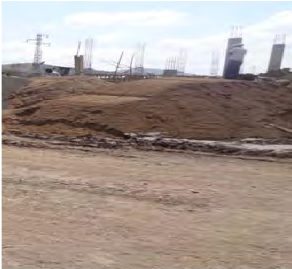
Figure 4.2: River sand supplied on the construction site

The other sources of sand observed on construction sites were from rivers. Some of the supplies were not pure and my field test result revealed that 8%, 23.5% silt content was found in the sample taken from stockpiles of the case studies. A similar laboratory test conducted by Saba Engineering for Anbesa Shoe Share Company for its expansion and relocation of the factory in Akaki-Kality Sub-city showed that the silt and clay content was 5%, 12.44% [15]. The sand with silt and clay content more than 6% had been washed before use as per the instruction of the consultants. The third source of sand was the crushed sand from aggregate production plants that will be discussed in 4.1.2. Since it was a rainy season, sand suppliers were unable to bring pure sand for construction projects from rivers (Fig. 4.2, 4.3); and the use of the crushed sand was allowed based on the test results taken from the site.