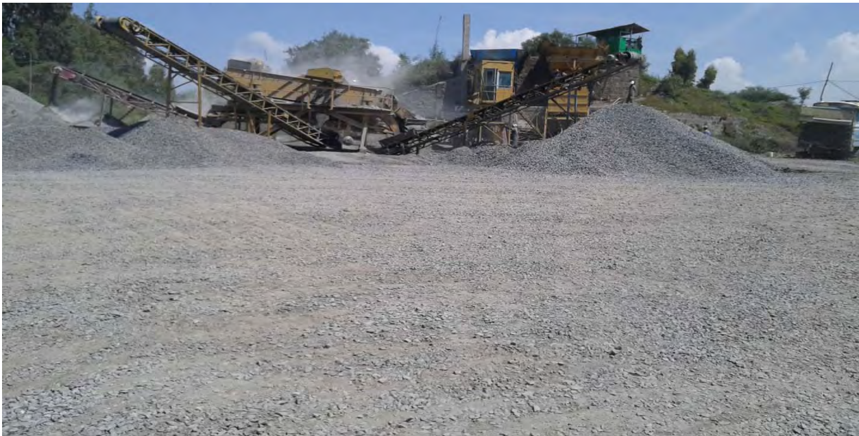
Figure 4.4c: Aggregate Production Plant