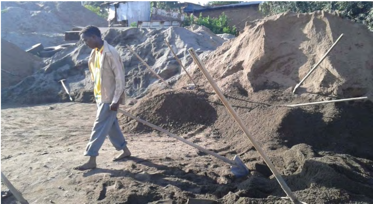
Figure 4.1b: Mixing sand from different sources at Hana Mariam site