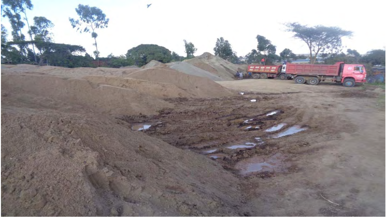
Figure 4.1a: Mixing sand from different sources at Hana Mariam site