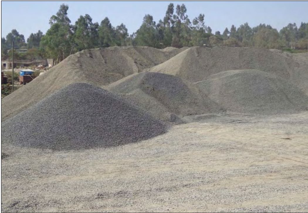
Figure 4.4d Aggregate Production Plant