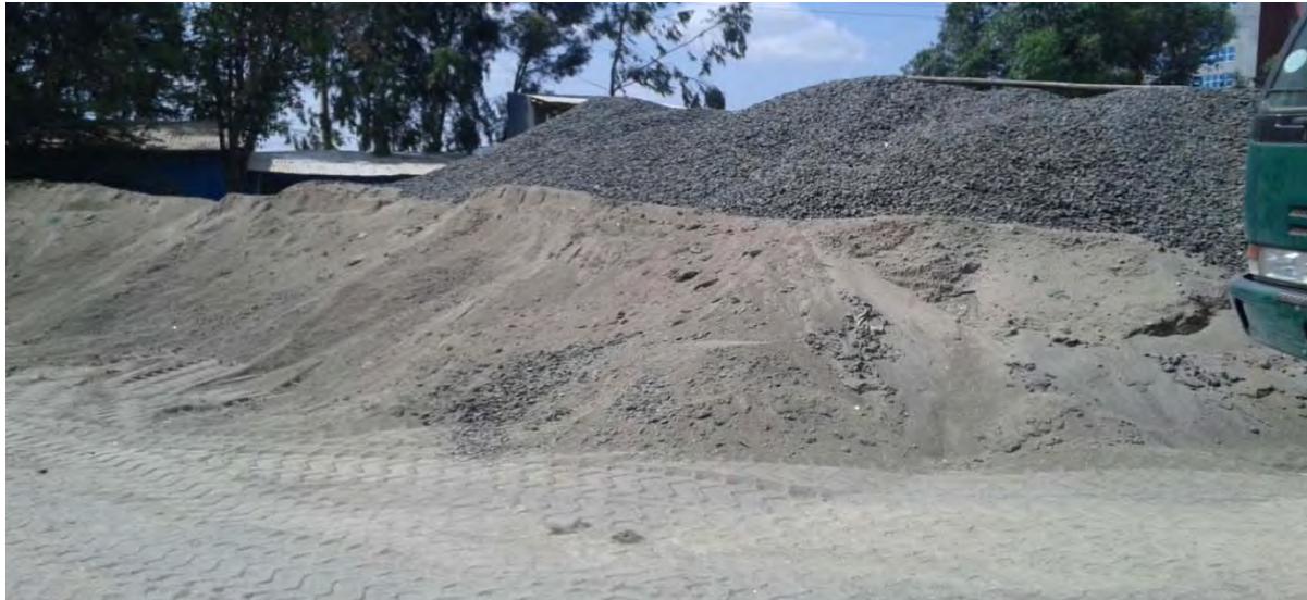
Figure 4.5b: Handling of Aggregates in Concrete Batching Plant

In the second batching plant (fig.4.5b), the aggregates were not stockpiled and stored on well prepared ground and an appropriate demarcation between different sizes of aggregates was not provided. The fine aggregate was placed adjacent to the coarse aggregate that the two different sizes were mixed each other; this inappropriate mixture will result in producing poor class of concrete. Therefore, handling of aggregates was not as per the recommendation in the literature.