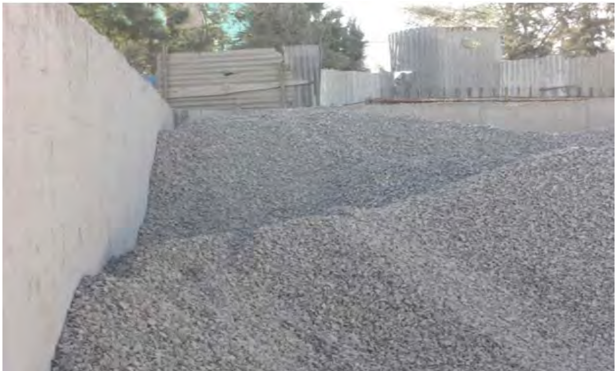
Figure 4.5a: Handling of Aggregates in Concrete Batching Plant

The literature stated that stockpiles should be as large as possible, as this helps to ensure uniformity of moisture content. Ideally, stockpiled sand should be allowed to stand for 12 hours before use so that, apart from the lower part of the stockpile, the moisture content will be reasonably uniform at about 5 –7 %. When sand is very wet the moisture content can be as high as 12–15%. Unless adjustments are made to the water added at the mixer, excessive variations in workability, strength and durability will result. A large stockpile of sand was observed in this plant, the moisture content is more or less similar, but this section is not well protected as that of coarse aggregate. It is simply protected by corrugated iron sheet fence that will not safe guard as that of the concrete shear walls and was not top covered and exposed to dust, and grasses were grown on stockpiles figure 4.5.