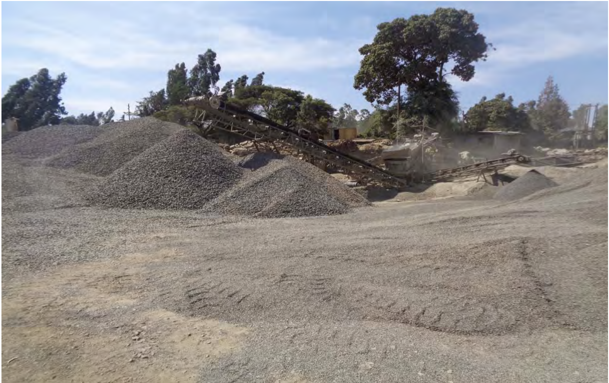
Figure 4.4a: Aggregate Production Plant

The Ministry of Urban Development and Construction has no sufficient documents related to aggregate production in an organized manner. One of the officers responded that the ministry had no full documents related to the construction materials in Addis Ababa and they know that there exists the gap in the production of aggregates and the ministry planned to have the construction department to regulate and fulfill the necessary gaps in the production and supply of construction materials in the construction industry.