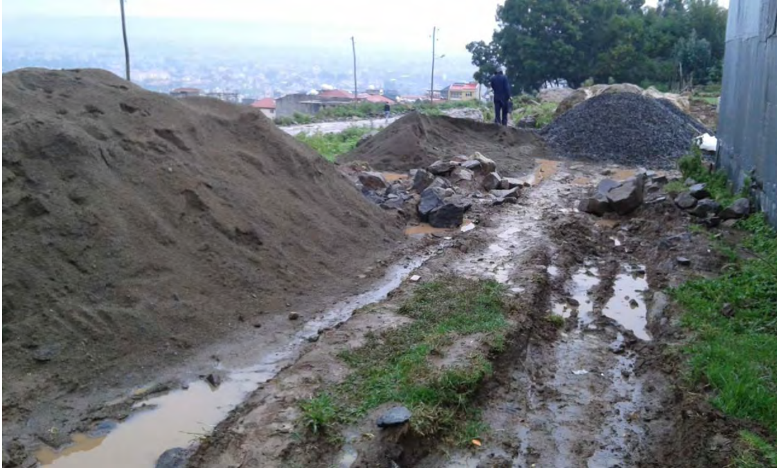
Figure 4.6c: Handling of Aggregates in Construction Site