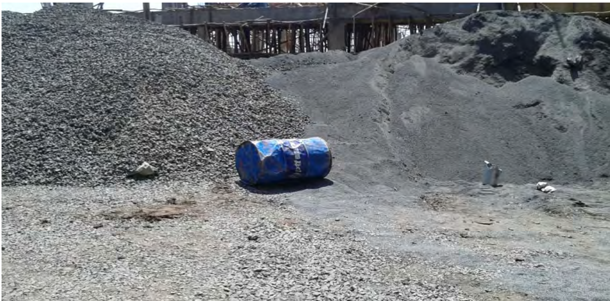
Figure 4.6d: Handling of Aggregates in Construction Site