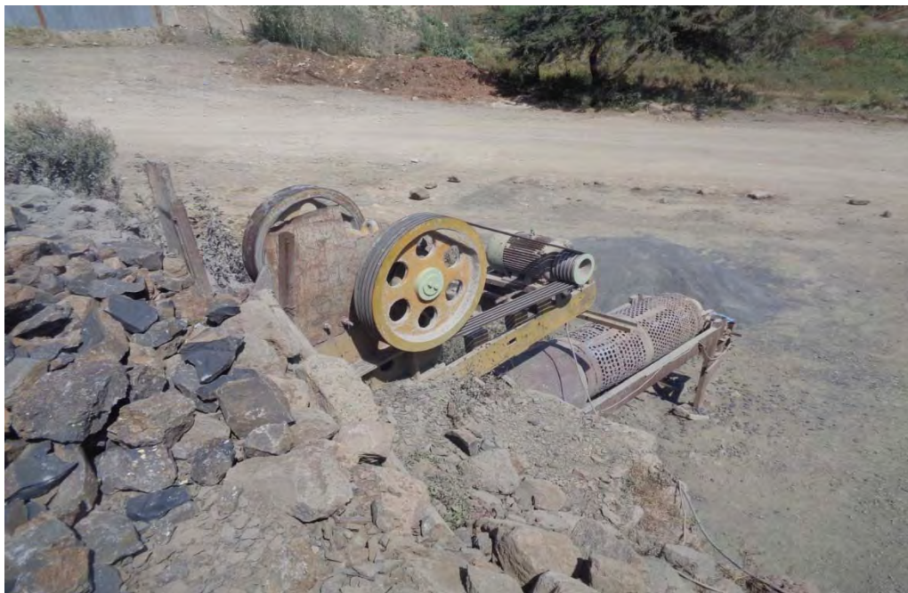
4.4e: Aggregate Production plant