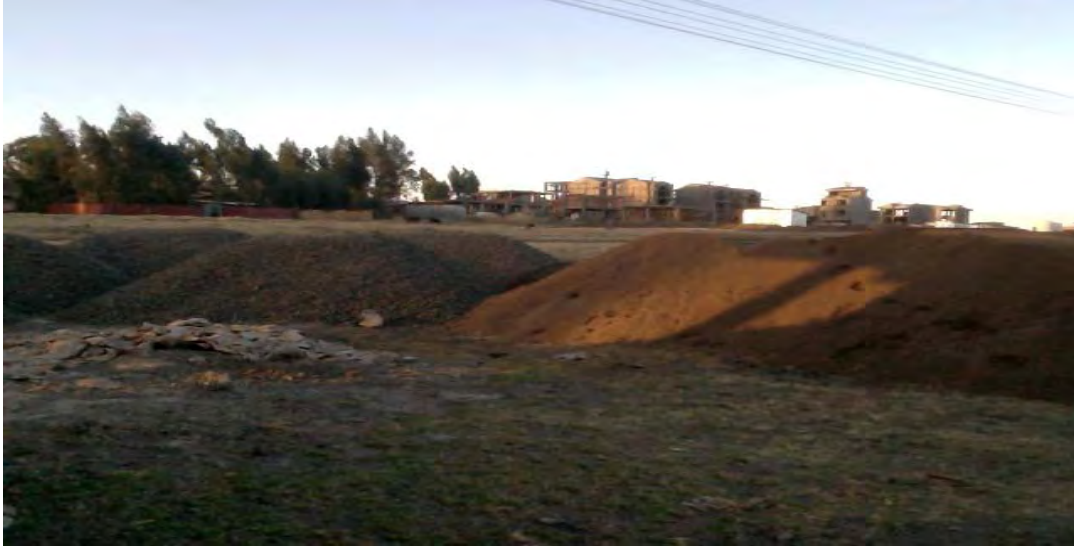
Figure 4.6a: Handling of Aggregates in Construction Site