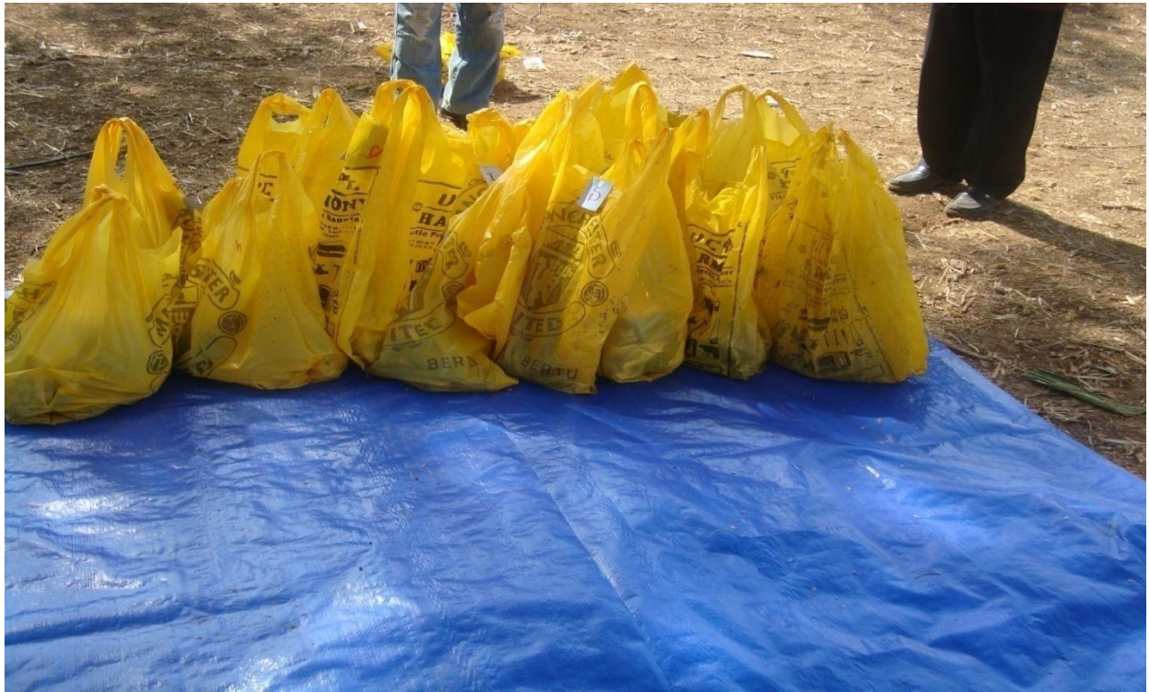
Plate 3: Collected waste before sorting