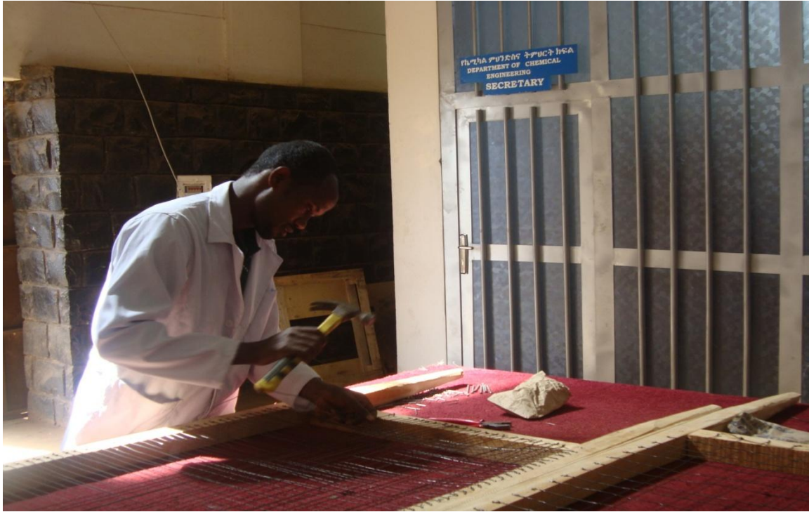
Plate 10: Preparation of sieves for size determination