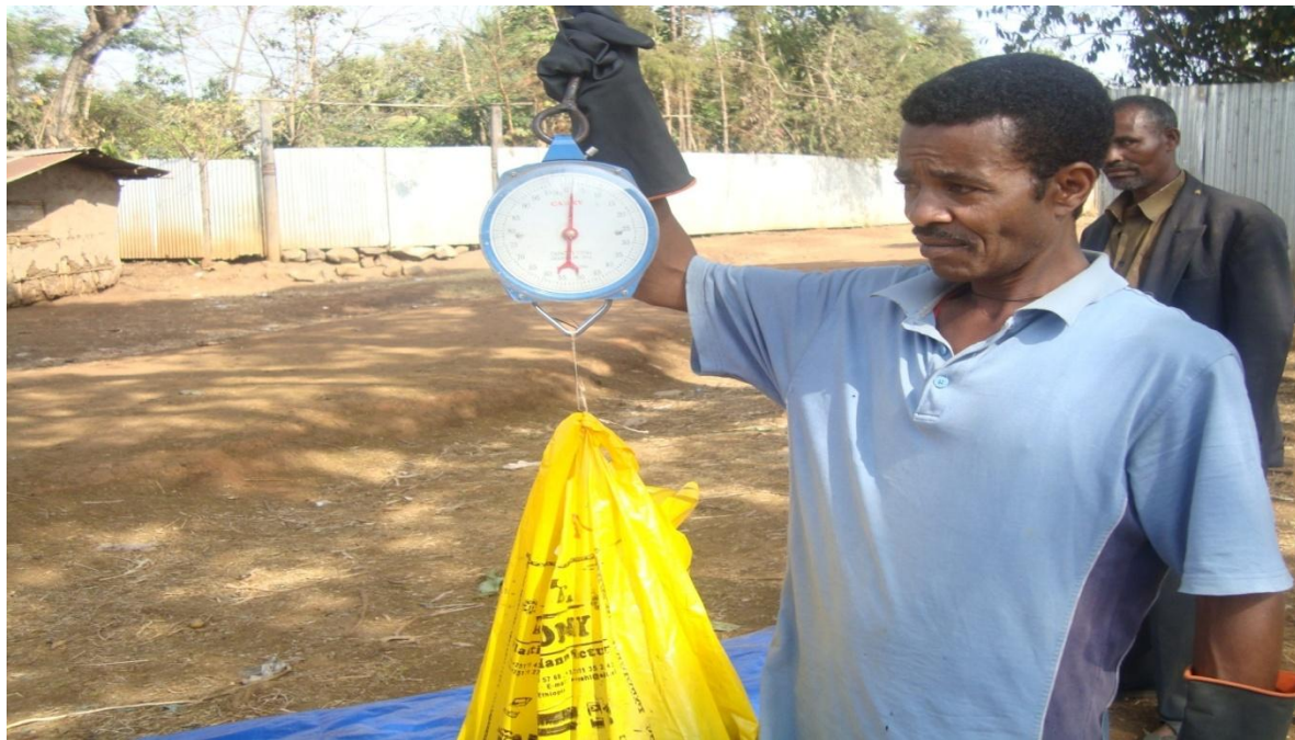
Plate 4: Measuring sample waste using scale balance