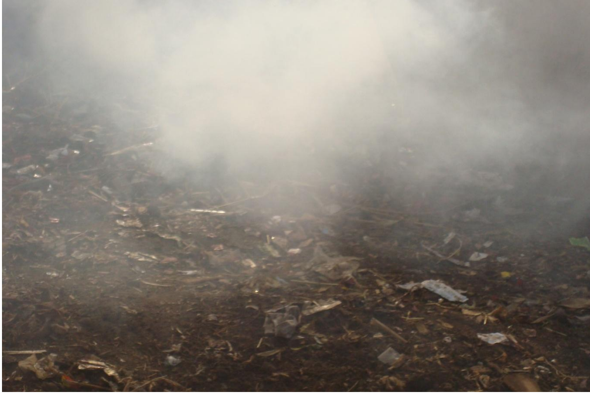
Plate 9: Waste incineration practice