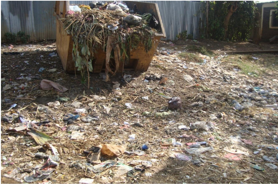
Plate 8: Unsafe transfer area