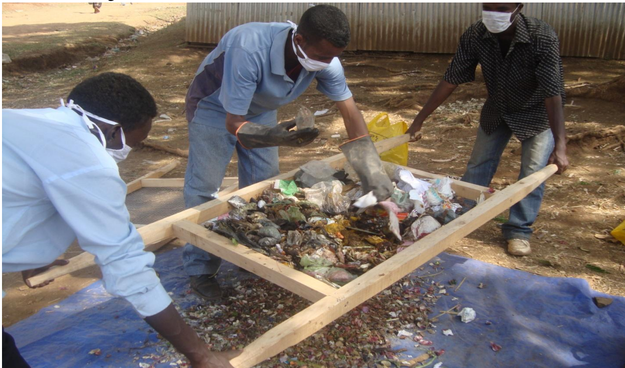
Plate 6: Sieving for the purpose of size determination