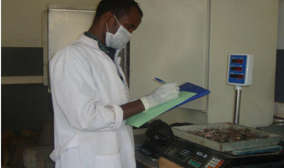
Plate 7: Measuring moisture contents