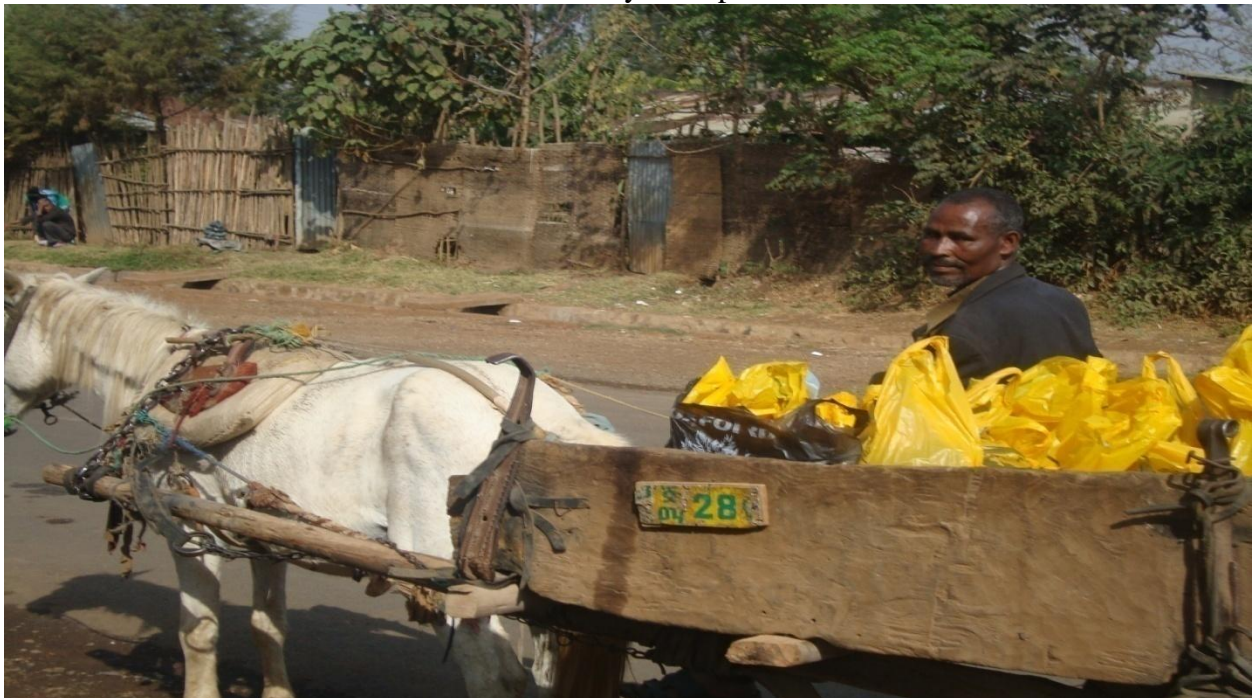
Plate 2: Taking collected samples to transfer area by cart