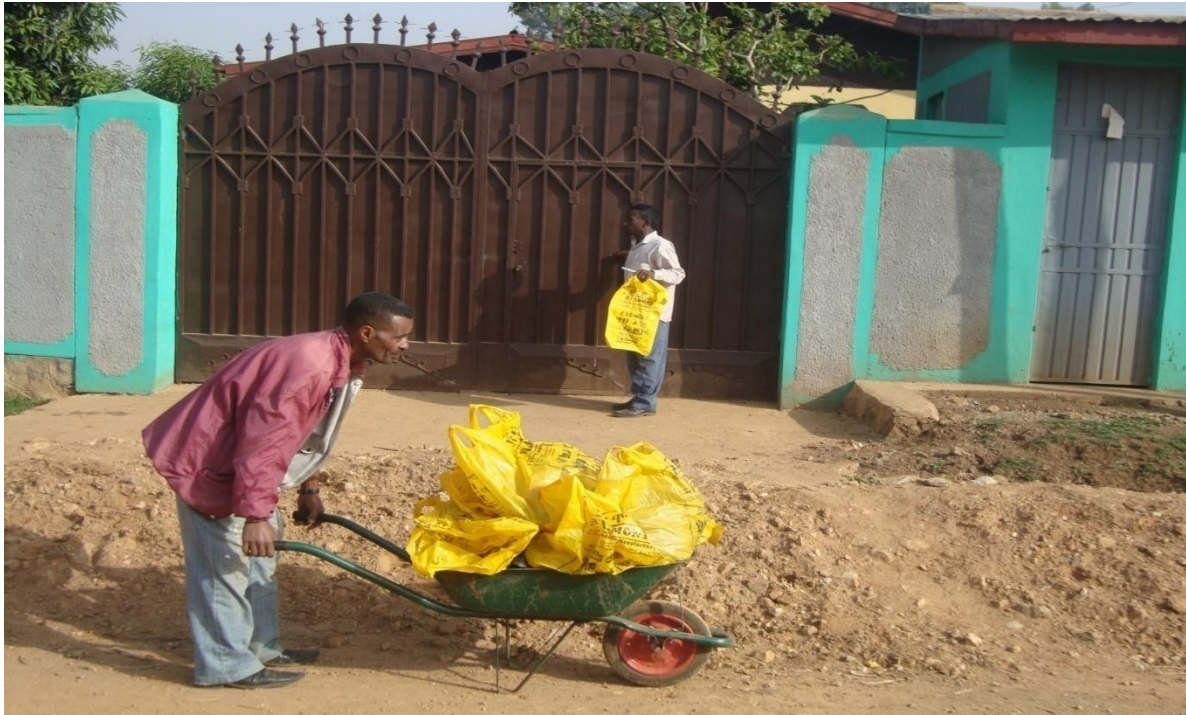
Plate 1: Collection of wastes from households by hand push cart