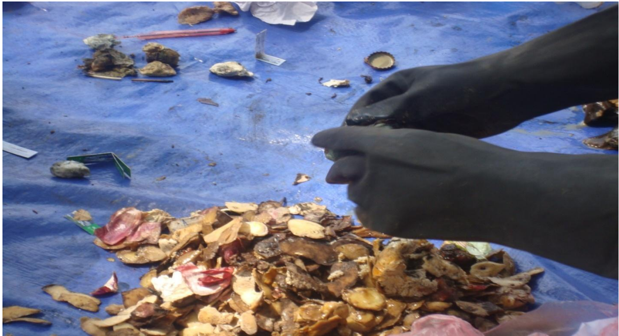
Plate 5: Sorting of solid waste