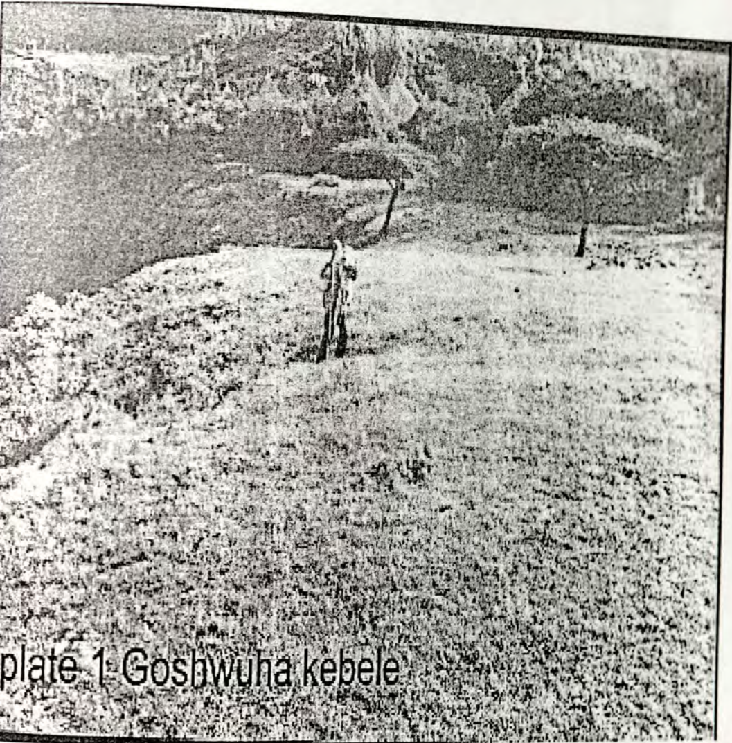
plate 1- Goshwaha kebele