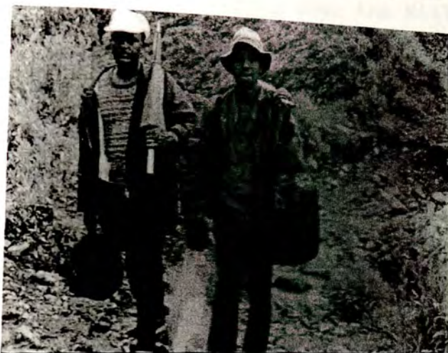
Plate 3 The Present Researcher on His Duties