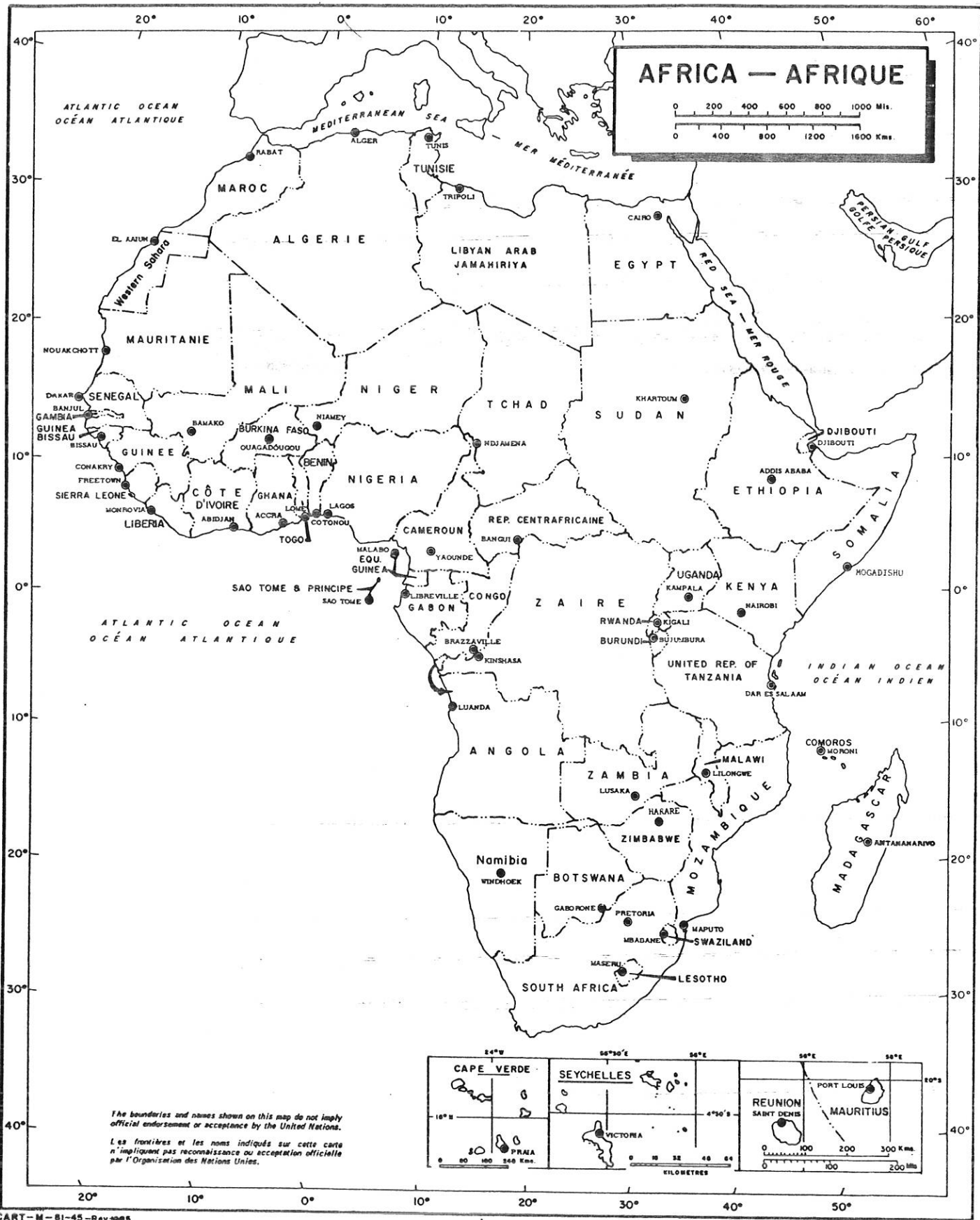
CART - M - 81-45 - Rev. 1985