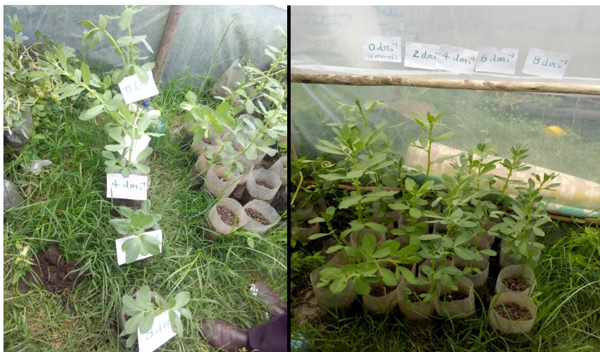
Figure: 1 Faba bean ( Vicia faba L.) growth at different salinities

Generally the result shows a negative relationship between salinity and stem height, and positive relation with tap root elongation. The leaf number irregularly decreased in all saline group when compared to control group (tap water) (Table 2).