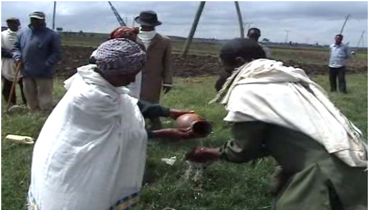
Here are the man's relatives while they are washing away the sin which they have been suffering from for the long time.