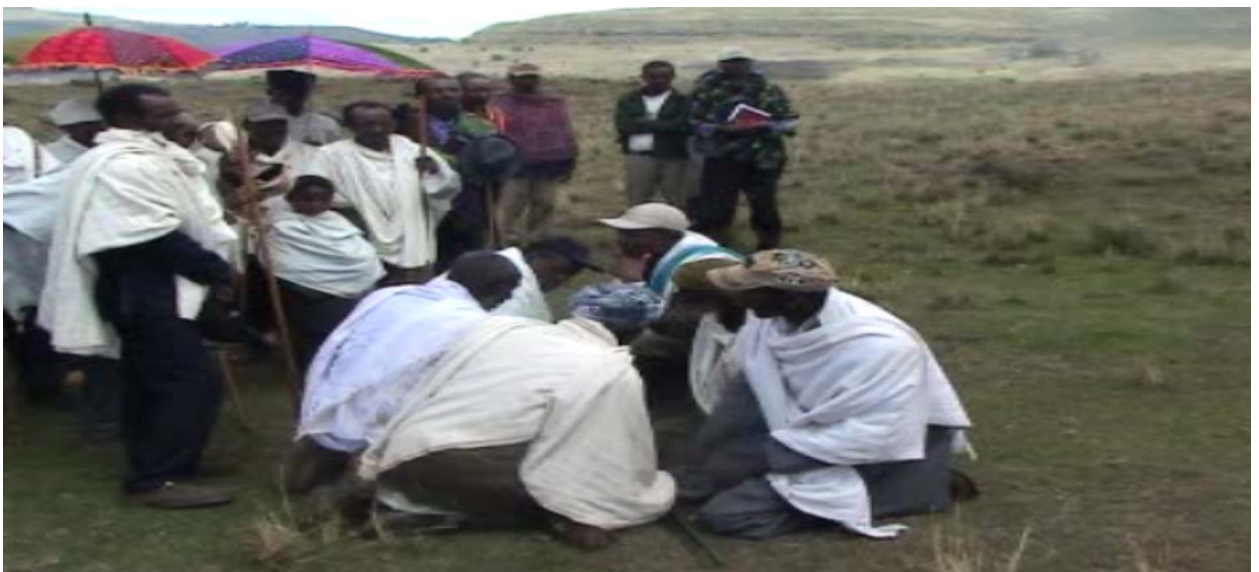
Here are three lukoos from each party in feud while they are go down on their knees and taking pledge not to avenge one another.