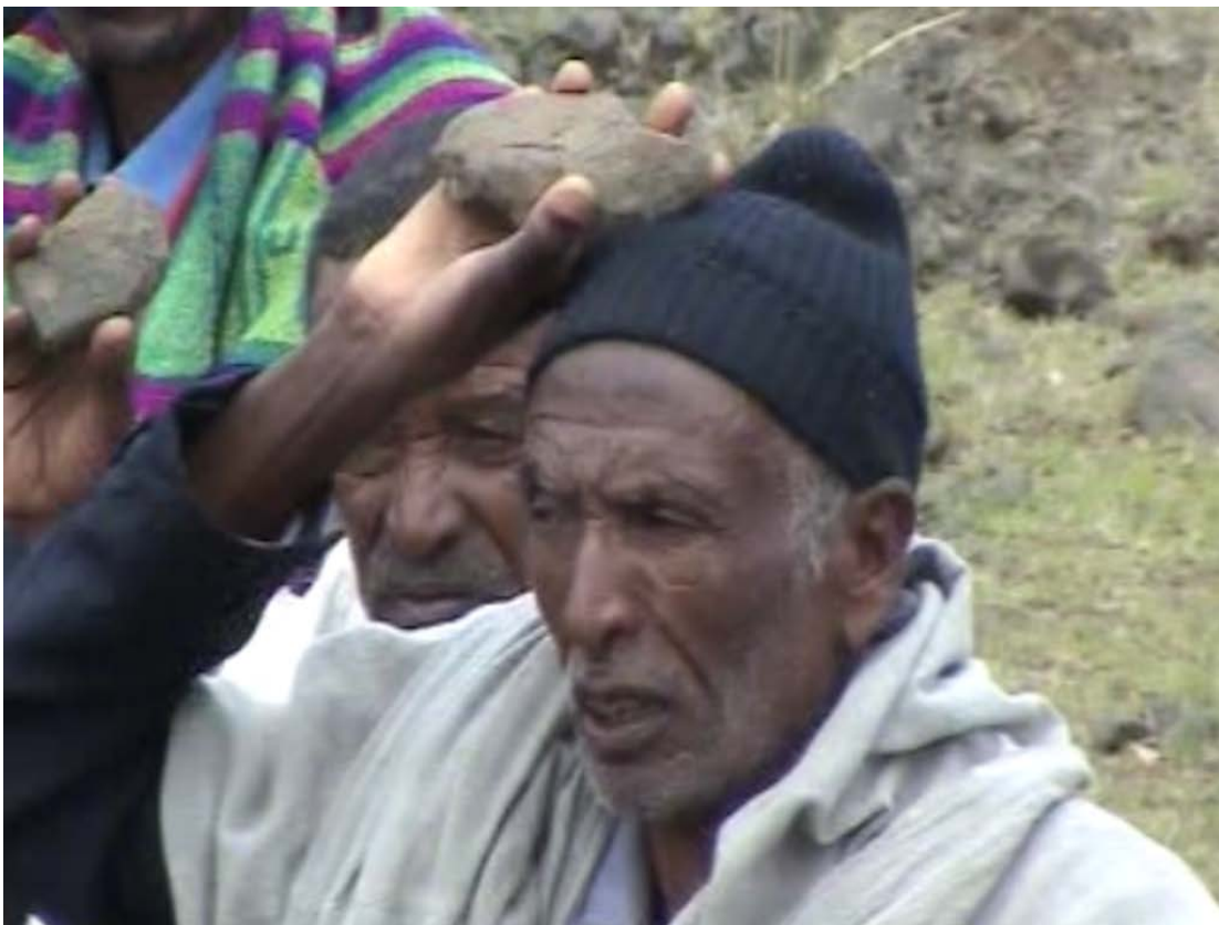
Mediator elders are carrying stones over their heads and supplicating from nearby of the harmed party.