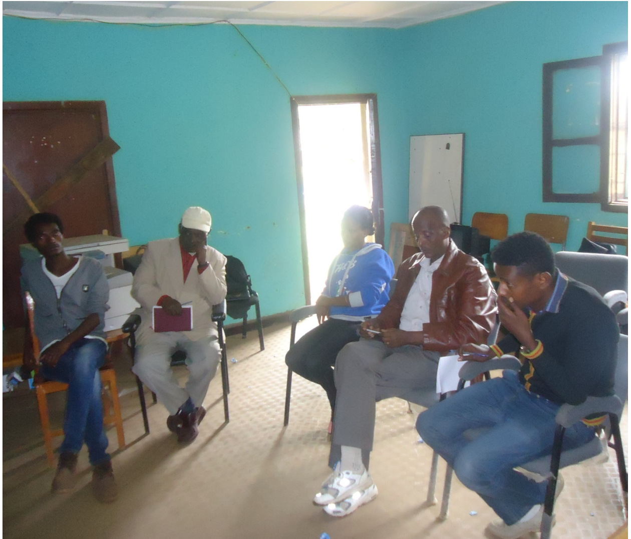
Photo of Focus Group Discussion Participants