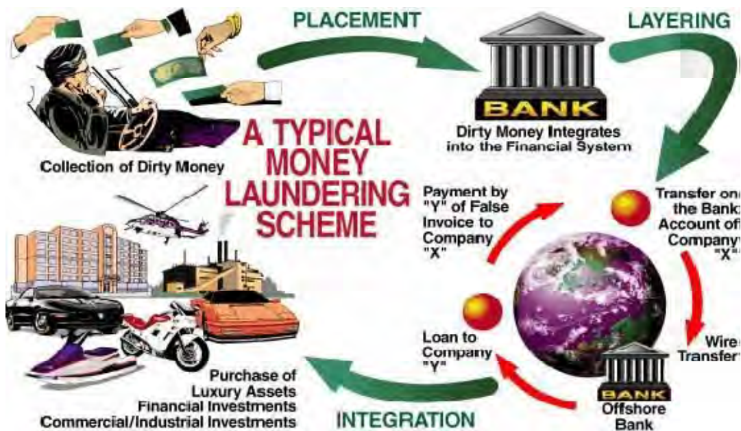
Fig 1; diagrammatical illustration of Steps of Money Laundering