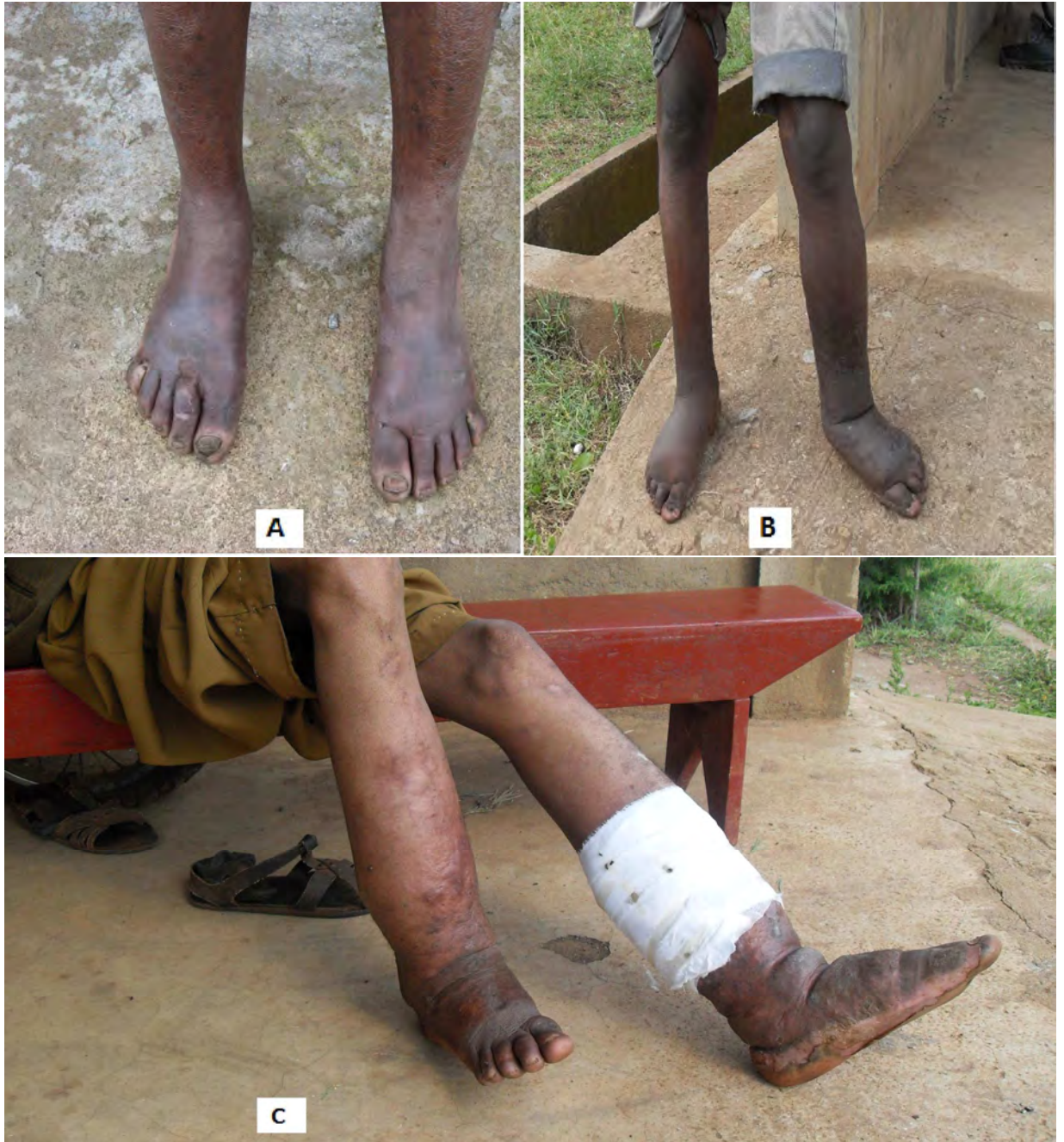
Figure 6. Clinical manifestations of podoconiosis in Wolaita: Stage 1 (A), Stage 2 (B) and Stage 3 (C) (photograph taken in the field, April and May, 2010).