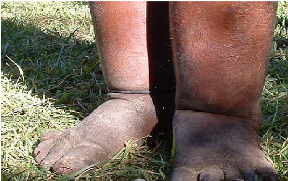
Figure 2. Soft 'water-bag' swelling in a 20-year-old man suffering from podoconiosis (Davey et al. , 2007).

Host genetic factors are important determinants of susceptibility to podoconiosis since not all individuals exposed to red clay soils develop podoconiosis (Davey et al. , 2007). The gene and environment interaction plays a role in development and progression of the disease. Price and Henderson (1978) had observed silicon and aluminium particles within lymph node macrophages of podoconiosis and non-podoconiosis individuals living on irritant soil. And their study suggested that there was abnormal reaction to mineral particles absorbed into the lymphatic system in the body of podoconiosis patients than in non-podoconiosis individuals. This implied the role of gene as predisposing factor for podoconiosis (Price and Henderson, 1978).