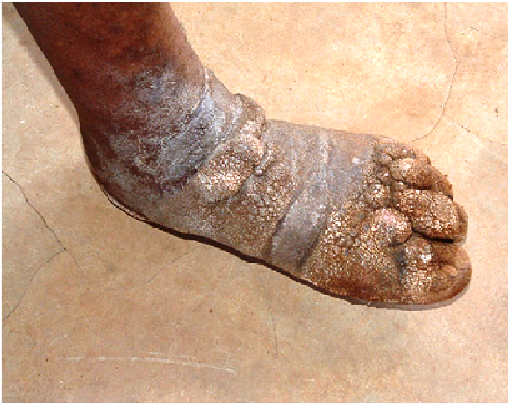
Figure 3. Hard and fibrotic type of swelling of the foot of a podoconiosis patient (Davey et al. , 2007).

The early symptoms in podoconiosis are characterized by skin itching of the forefoot and a burning sensation in the lower leg, particularly the foot. Plantar edema, lymph fluid oozing from the area, increased skin markings and skin papillomas as well as rigid toes are early changes observed in early signs of podoconiosis. In the later stages of disease progression, the symptom of lower leg swelling may be noticed either as soft elephantoid (Figure 1) leg or hard and fibrotic type of swelling (Figure 2). The nature of progression of the disease from early to later clinical signs is very dormant and may take few to several years. Therefore, the victim suffers from the disease throughout life starting from the onset of the condition (Davey et al. , 2007; Price, 1990).