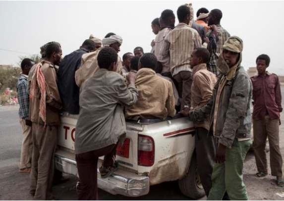
Picture1. Ethiopian migrants in Yemen piling in to pickup car to work in chat farms. (obtained from Human Rights Watch report 2014:29)

However, the reverse is true as mentioned in the documentary program. On the contrary, a total of 200 torturing and smuggling camps are available at Haradh town close to Red Sea coast and border with Saudi Arabia in southern direction. In these camp Ethiopian smugglers abused and ruthlessly tortured their own citizens without mercy. According to Human Rights Watch (2014:27), Haradh hosted an average of 25,000 migrants who wish to travel to Saudi Arabia or return to their home country. The weather situation of Haradh, especially the location of the camp is extremely heat and prone to flash flooding. Likewise, almost 80% of their local economy is based on smuggling of people. The following couple of photos are indicative of the sufferings of the migrants in Yemen.