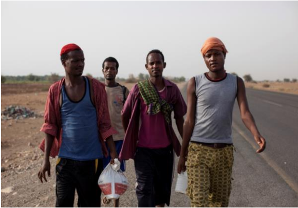
Picture2. Migrants travelling to Saudi Arabia through Yemen’s Hodaida-Haradh road.(obtained from Human Rights Watch report 2014:29)

Geographically, migrants are coming from different parts of regions in Ethiopia, mainly from Amhara region North and South Wello and Oromia region Jimma and its surrounding. In this informative radio documentary program the journalist revealed how migrants are financially exploited and physically abused by organized human trafficking networks both in the origin and destination countries. The travel route for illegal migrants is depicted on the map annexed at the end of this paper (annex VII).